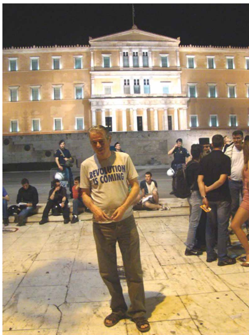
June 2011, a man standing in front of the parliament house watching the association of unemployed playing football on Amalias Avenue

apparatus, but many, diverse historical-material and contextual factors contributing towards the particular political event. This grew spontaneously into a social movement, without the Party leadership that Lenin and Gramsci had in mind.