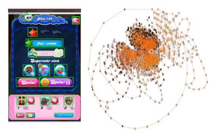
Al testing levels in Candy Crush, detecting elements and a graph generated after traversing all the levels in-game

Al can be used to give direct feedback to developers and to test their products. In the case of Candy Crush Saga, a puzzle game that has been on top of the charts for almost 8 years and that gained $1 billion in sales of digital goods alone in 2019<sup>24</sup>, the game developers, King Digital