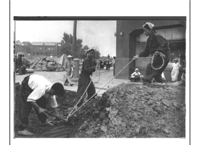
Rebuilding Pyongyang. From Chris Marker, Coreennes (Paris: Seuil, 1959).

would require all the work and resources the North Korean people could muster.