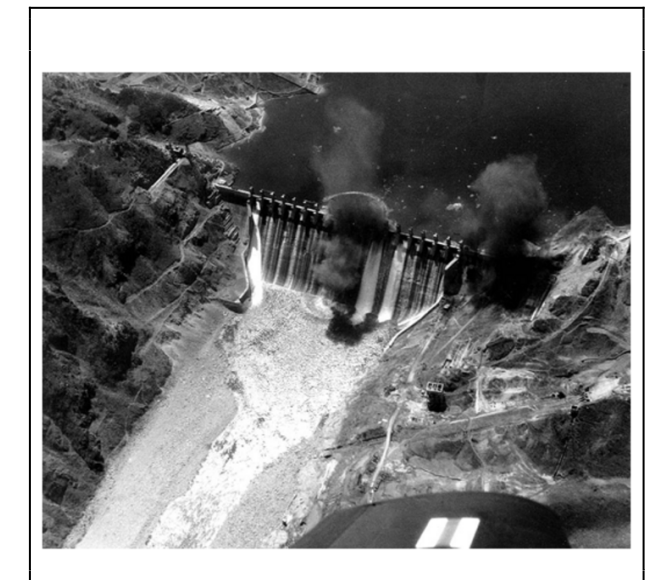
Aerial bombardment of Hwachon Dam.

1950 and 1951. To escape the bombing, entire factories were moved underground, along with schools, hospitals, government offices, and much of the population. Agriculture was devastated, and famine loomed. Peasants hid underground during the day and came out to farm at night. Destruction of livestock, shortages of seed, farm tools, and fertilizer, and loss of manpower reduced agricultural production to the level of bare subsistence at best. The Nodong Sinmun newspaper referred to 1951 as "the year of unbearable trials," a phrase revived in the famine years of the 1990s.9 Worse was yet to come. By the fall of 1952, there were no effective targets left for US planes to hit. Every significant town, city and industrial area in North Korea had already been bombed. In the spring of 1953, the Air Force targeted irrigation dams on the Yalu River, both to destroy the North Korean rice crop and to pressure the Chinese, who would have to supply more food aid to the North. Five reservoirs were hit, flooding thousands of acres of farmland, inundating whole towns and laying waste to the essential food source for millions of North Koreans. 10 Only emergency assistance from China, the USSR, and other socialist countries prevented widespread famine.