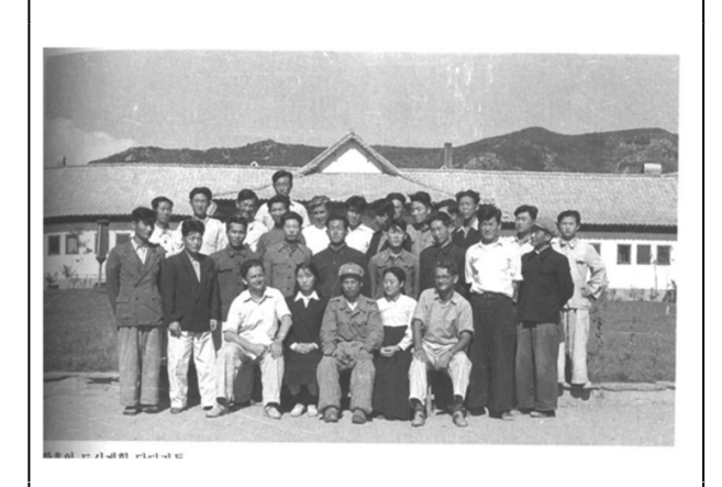
Korean and German workers in the Hamhung reconstruction project, late 1950s. From Paek Sŭng-jong, Tongdok top'yonsu Ressel ŭi Puk Han ch'uok (Seoul: Hyohyŏng ch'ulp'ansa, 2000)

grenades; for good measure, a naval bombardment hit the airport later that afternoon. Meanwhile, some 100,000 North Korean refugees were transported from Hungnam to South Korea by US navy LST's in the so-called "Christmas Evacuation" of December 19 - 24. Out of the rubble of a destroyed and depopulated Hamhung, the North Koreans and East Germans built a new industrial city.