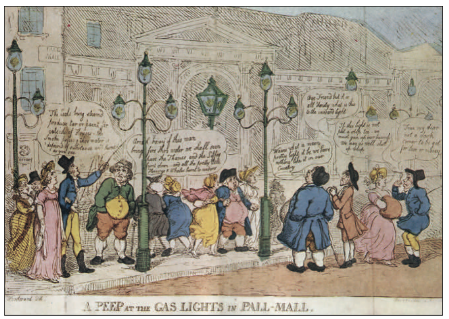
FIGURE 1 – A satirical cartoon showing people marveling at the early public gas lighting in London.

In a few decades, commercial and public gas lighting boomed in many cities in Europe (e.g., France, Belgium, Germany, and Russia) and the Americas (starting in the Unites States) because of its lower cost compared to conventional oil lamps and candles. The savings was about 75%. Even if gas lamps could