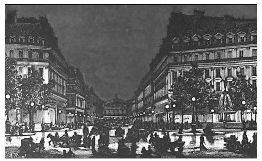
FIGURE 3 – Electric lighting with Yablochkov's candles along the Avenue de l'Opéra at the 1878 Paris Exposition. It triggered a boom in gas utility stocks.

models), the Yablochkov candle [10]. Its design featured two parallel electrodes set side by side to maintain their distance while consuming, with no need for automatic adjustment (Figure 2). To improve its performance, Gramme developed an efficient alternator in 1878 whose alternating current ensured the balanced consumption of the two carbon electrodes. The same year, the Grands Magasins du Louvre in Paris was supplied with eight Yablochkov candles powered by a Gramme alternator. Similar systems were soon implemented in the Avenue de l'Opéra and the Place de l'Opéra on the occasion of the Paris Exposition of 1878 (Figure 3).