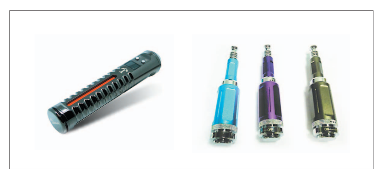
Figure 3: Examples of 'third generation' electronic cigarette

Electronic cigarettes have been developed as a 'lifestyle' or consumer product, and not as a medicine. Regulatory authorities in some countries have ruled that, as they contain nicotine, electronic cigarettes automatically fall under medicines regulation.<sup>e.g.2</sup> The UK Medicine and Healthcare Products Regulatory Agency (MHRA) ruled in June 2013 that electronic cigarette manufacturers would need to obtain a license to sell electronic cigarettes by 2017.