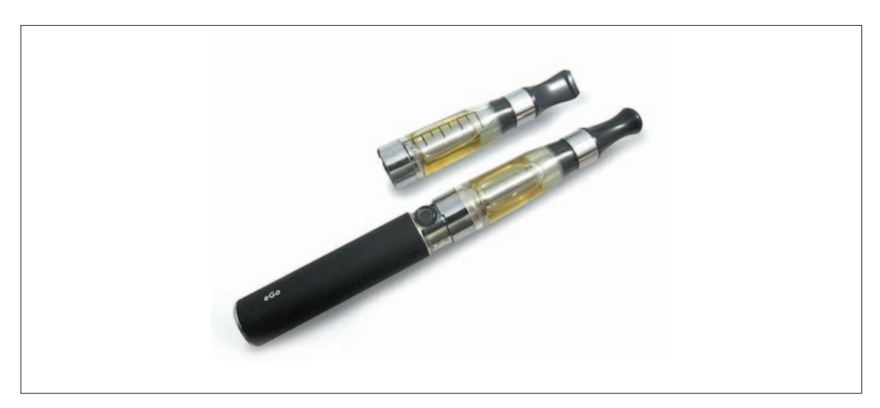
Figure 2: Example of a 'second generation' electronic cigarette

The 'second generation' electronic cigarette look less like a regular cigarette and usually contain a 'tank' that the user fills with their choice of electronic cigarette liquid; in which they can decide upon flavours and strength (nicotine concentration typically ranging from 0 to 24mg/ml). There appears to be a trend towards more experienced electronic cigarette users ('vapers') preferring newer generation electronic cigarettes (often called personal vapourisers). These bear little resemblance to cigarettes and can be used with a range of atomisers, cartomisers, and tank systems giving the user a greater range of choice. These systems typically use larger batteries with adjustable power settings and replaceable coils and wicks.