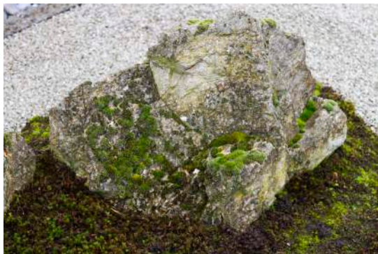
5. Cedar and cushion moss

The moss at the foot of the rocks is cedar moss which is to be found not only in Cumbria, as well as in the countryside close to London, but also in almost every temple garden in Japan. It is so-called because it has a stalk and is easily seen in the mind's eye as a forest tree. The cushion moss, on the other hand (5), which has gradually colonized all the originally bare rocks, is a purely self-seeded local type brought in by birds or wind-blown spores, and carries with it the idea of woods climbing up the deep valleys and steep, rocky slopes of the mountains.