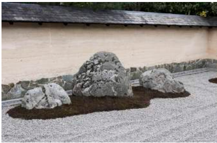
3. The main group of three rocks

As a result there is a wide range of textures and degrees of hardness, with different kinds of roughness and smoothness as well as variations of colour. Along with innumerable tones of brown and grey, together with pure whites, there are even shades of pink in the two rocks on the right, while several different colours may be