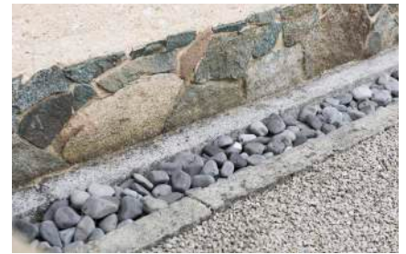
4 The base of the cob wall

As a result there is a wide range of textures and degrees of hardness, with different kinds of roughness and smoothness as well as variations of colour. Along with innumerable tones of brown and grey, together with pure whites, there are even shades of pink in the two rocks on the right, while several different colours may be