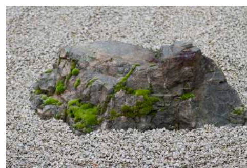
13 The right foreground rock

There, the large central rock is one-third buried and the vertical rock at the end of the garden is half underground, while the rock in the right foreground (13), which was lying on its side close to a stream, is the most deceptive of all, as it is fully four-fifths underground. Moreover, since it widens to left and right and thickens as it goes down, it is so large and heavy that it required a cradle of steel scaffolding poles and eight strong men to carry it up to the nearby gravel track.