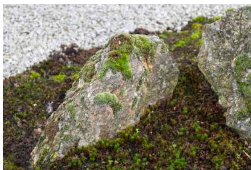
12. The foreground rock on the left

The final outcome is that, seen from the meditation platform, the perspectival convergence of the parallel lines of the large furrows greatly increases the apparent length of what is actually quite a small garden, while the way in which the long diagonal lines of sight to its far corners have been left completely clear of rocks further increases the resultant sense of space.