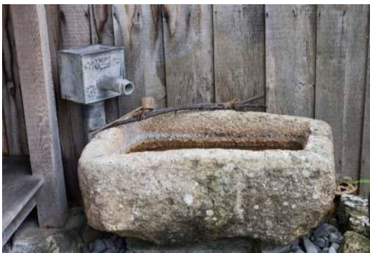
19. The chozubachi

Although it is not within the garden itself, the chozubachi or water basin (19), in the corner next to the verandah of the house is of particular interest, since it was hacked out of a single block of hard conglomerate rock by French prisoners of war on Dartmoor in the early 19th century.