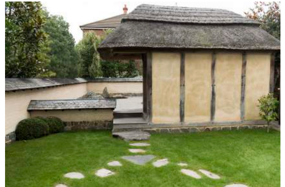
1. The entrance to the Zen Garden

Despite its obvious, all-important ancestry and innumerable points of contact, it is not in fact a copy of a Japanese Zen garden, but an attempt to get a feeling for the underlying principles and then, however wisely or unwisely, to extend them.