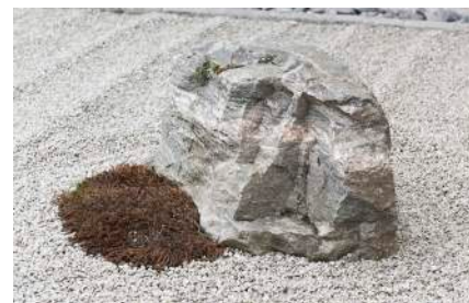
9. The rock on the far right

As in every Japanese karesansui garden, the final effect of calm space, created as a starting point for meditation, to a large extent depends on the particular, unique pattern of the raked gravel (10).