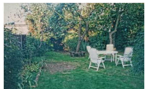
16. The old garden

This epitomizes the fact that all the making of the garden, including the clearing of the trees and tangled shrubbery of its original, rather rundown English precursor (16), and also the trenching of the entire space in order to remove every single remaining root and so avoid the