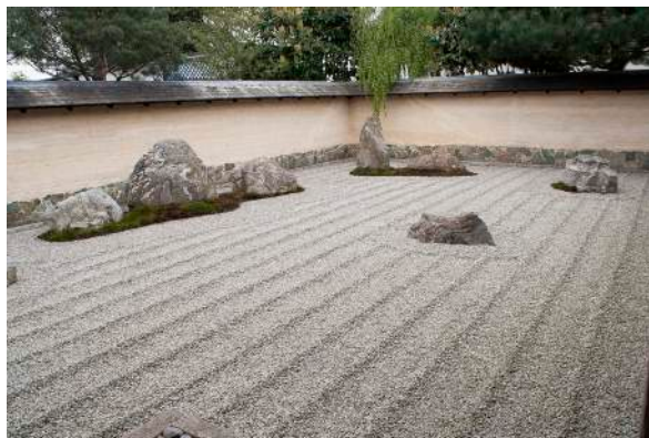
10. The raking pattern of the gravel

work each time takes some five or six hours to do, since it is not just a matter of make do and mend and the whole of the gravel surface has to be completely smoothed before the exact, original pattern is brought back into being.