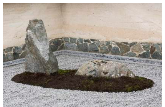
8. The vertical and horizontal rocks

That particular rock is pivotal in another sense, since it is set to face directly