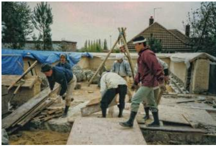
17. Japanese helpers at work

slightest danger of any shoots forcing their way up through the gravel, was done by hand.