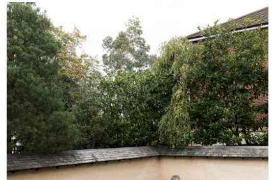
18. Trees in and beyond the Garden

The principle of harmony out of diversity is also expressed in the variety of the trees that were planted round the perimeter (18) when they were not more than four or five feet high, and which now shield it from the neighbouring suburban buildings and, at the same time, connect the garden with the natural world of the trees beyond its highly artificial confines.