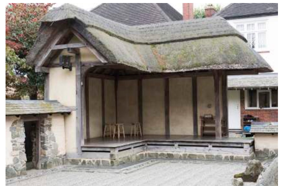
6. The meditation shelter

If one allows one's eye to start with the five rocks in the left foreground (7) and follow their apparent flow, the final, small rock leads directly to the main, central rock in the group of three which runs down on down towards the vertical stop-rock (8) on the far left. The low, horizontal rock beside the latter then immediately points the way to the single, distant rock (9) on the opposite side of the garden.