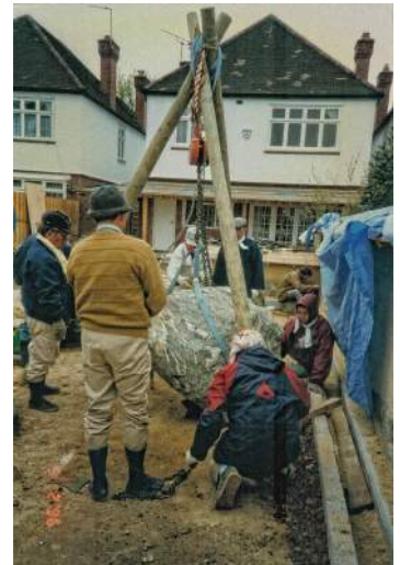
14. A wooden tripod in use

This age-old principle is not just a feature of Japanese design, but is also honoured in the West. The sculptures from high up in the pediment of the fifth-century BC Parthenon in Athens were never intended to be seen from the rear, and for over two thousand years they never were. But now, in the British Museum, it is possible to walk behind them and discover that the drapery on the backs of all the figures is as finely and as intricately carved as that on the front.