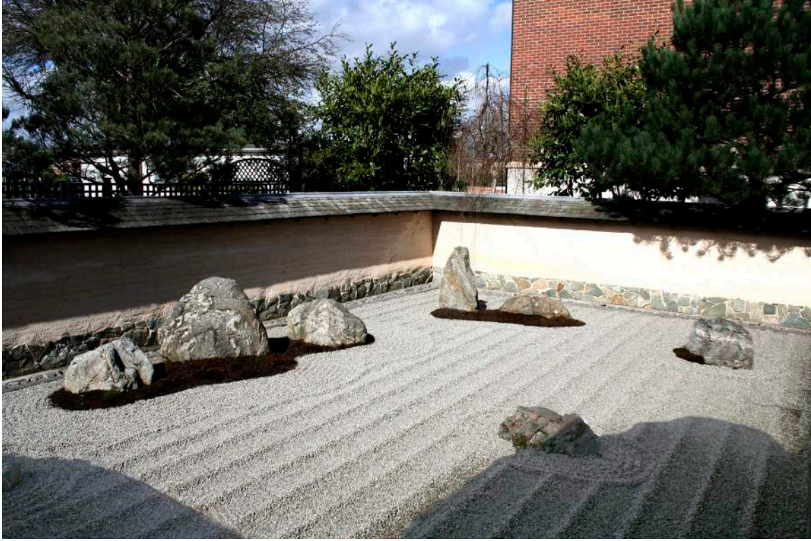
20. The garden from the ideal viewing point

Most people tend to think in terms of solids, rather than of the emptiness between them, and that way of thinking leads to disaster in many so-called Zen gardens. The starting point must always be empty space and the rocks are simply spaces within a space, a concept which, expressed in the form of a waka , has for many years appeared on the Three Wheels website.