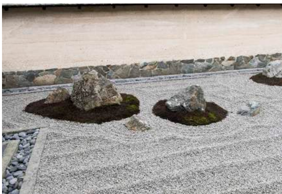
7. The opening group of five rocks

When that is seen, it then becomes impossible to miss the rock in the middle distance on the right, which points directly back to the centrepiece of the group of three.