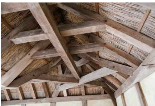
15. The structural timbers of the shelter

The cob of the enclosing wall, composed of a mixture of chalk, sand and lime, and capped by Cumbrian slate tiles, the greys and browns of which form an intimate link with the rocks and gravel of the garden itself, is a centuries-old structural material still to be seen in many farm buildings, particularly in the southwest of England, but is also common in Japan, where it is often found in the surrounding walls of temples. There, however it is usually given a coating of plaster and grey-white paint.