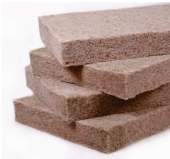
Fig. 2. Hemp bricks [4].