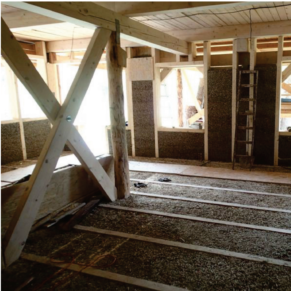
Fig. 6. Hemp concrete walls and floors [4].

The ready-made construction is a reward for the investor because the plants, the animals and he feels good in it, do not breathe the spores of molds and other products resulting from excessively moisture-free. Natural materials additionally support the preservation of so much for our health of important negative ions in the air.