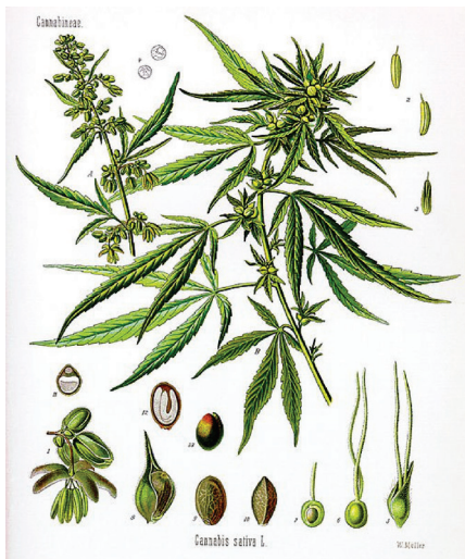
Fig. 1. Cannabis sativa [1].

Another product, cannabis seeds, contains 30-35 % fatty acids with a high fat content. Cannabis oil obtained from cannabis pressing can be used as a motor fuel, for the production of paints and varnishes for natural wood preservation, or can be used in the food and canning industry. Cannabis seeds are used in the food industry, fishermen and bird breeders. Crops that remain after pressing the seeds are used as dietetic feed for livestock or as fuel [3].