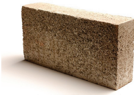
Fig. 4. Hemp concrete [4].

Apart from the fact that hemp concrete is a universally functional and affordable building material, it is also environmentally friendly, its environmental balance is A+.