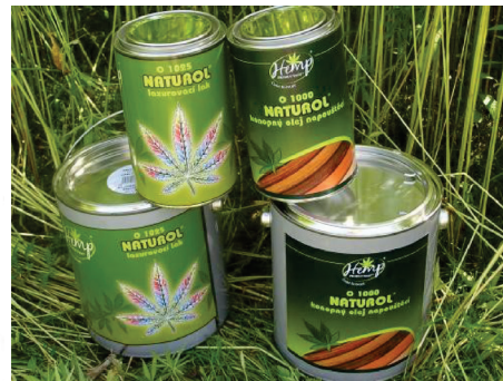
Fig. 5. Hemp oil and varnish [1].