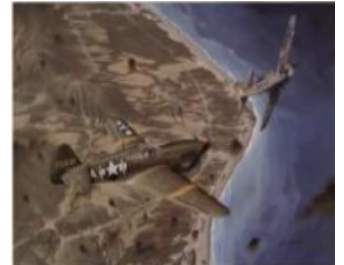
99th Fighter Squadron