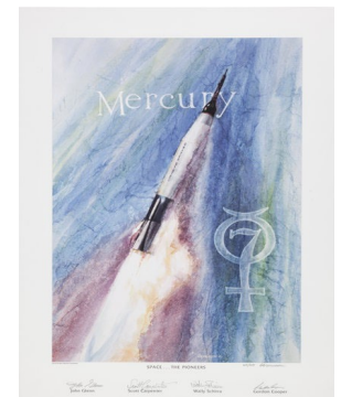
Space... The Pioneers