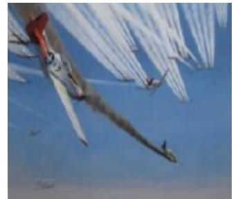
100th Fighter Squadron