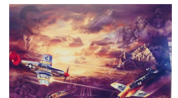
The Legend of the Red Tails

This painting depicts a World War II battle in Germany involving the Tuskegee Airmen, a group of African-American military pilots (fighter and bomber). They formed the 332 nd Fighter Group and the 477 th Bombardment Group of the United States Army Air Forces.