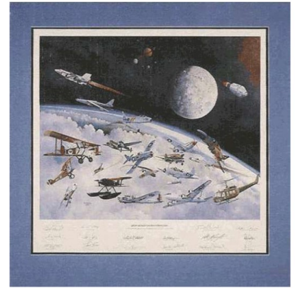
Gathering of Eagles

*WPAFB Wright Patterson Air Force Base **CNAR Cleveland National Air Races ***EJA Executive Jet Aviation ****STS Space Transportation System, denotes Space Shuttle