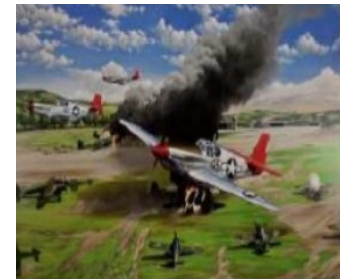
301st Fighter Squadron