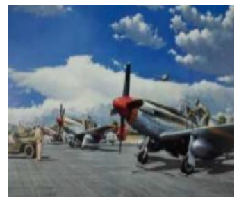
302nd Fighter Squadron