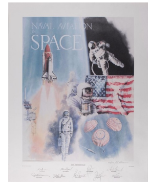
Naval Aviators in Space