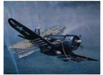
He Who Dares

Thomas Hudner was later awarded the nation's highest award for bravery, the Medal of Honor, for his attempted rescue of Jesse Brown.