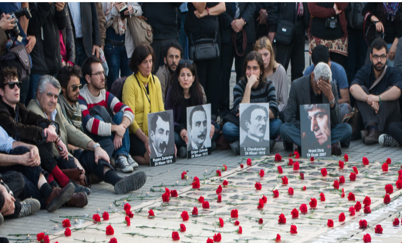
Protestors gather in Istanbul's Taksim Square to commemorate the Armenian genocide.