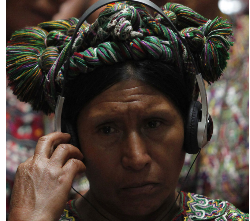
An indigenous woman from Guatemala's Ixil region attends the trial of former dictator Efraim Rios Montt in Guatemala City.