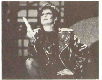
Guesch Patti Rest Debut Single