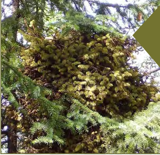
Figure 10. A live spruce broom rust (witch's broom) on a young white spruce. Dead brooms can persist for decades on live trees, and larger ones provide habitat for several birds and mammals.