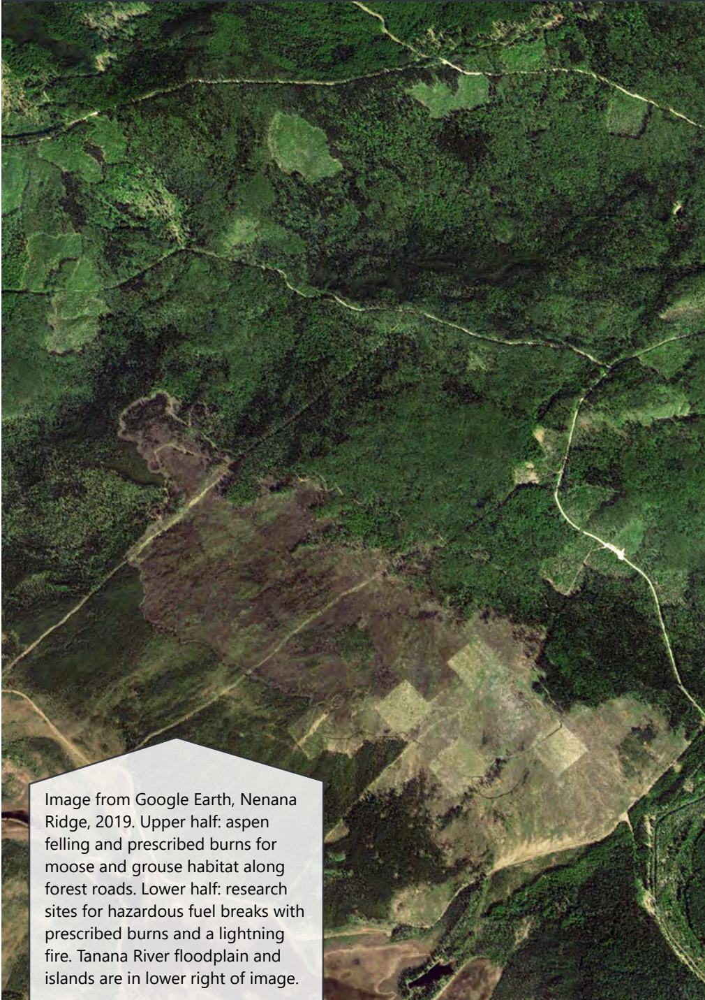
Image from Google Earth, Nenana Ridge, 2019. Upper half: aspen felling and prescribed burns for moose and grouse habitat along forest roads. Lower half: research sites for hazardous fuel breaks with prescribed burns and a lightning fire. Tanana River floodplain and islands are in lower right of image.