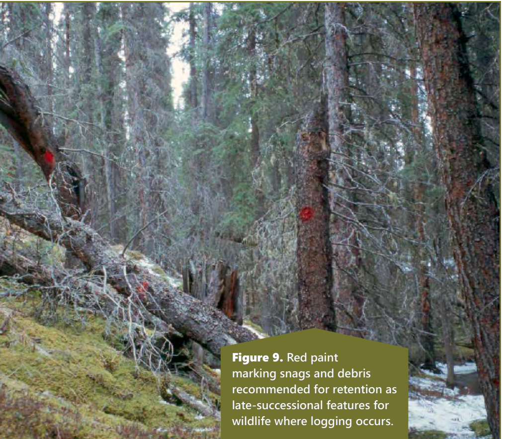
Figure 9. Red paint marking snags and debris recommended for retention as late-successional features for wildlife where logging occurs.

It is easy to retain specific habitat features important to wildlife – called retention patches – by marking them with paint ( Fig. 9 ) or flagging above typical winter snow depth to avoid removal until fellers become trained on which features to leave.