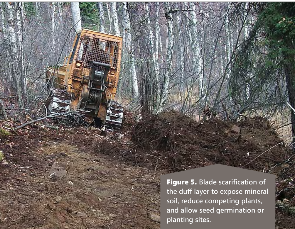
Figure 5. Blade scarification of the duff layer to expose mineral soil, reduce competing plants, and allow seed germination or planting sites.

Unlike scarification by disk trencher, blade scarification requires operator experience to avoid scalping away too much of the organic layer (which retains moisture on dry sites and provides nutrients for seedlings over time). Moss or turf divots on cool or wet sites ideally should be pushed to the north side of scarified patches to reduce shading, whereas divots on drier, well-drained sites should be pushed to the south side to provide shade and reduce the drying effect of summer sun.