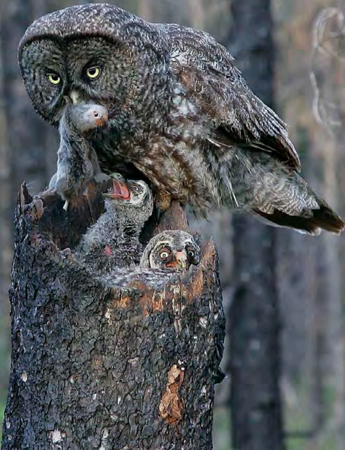
Figure 7. A Great Gray Owl feeding a yellow-cheeked vole to its chicks in the broken top of a burned spruce. These owls feed on small mammals that can girdle young trees on reforestation sites.