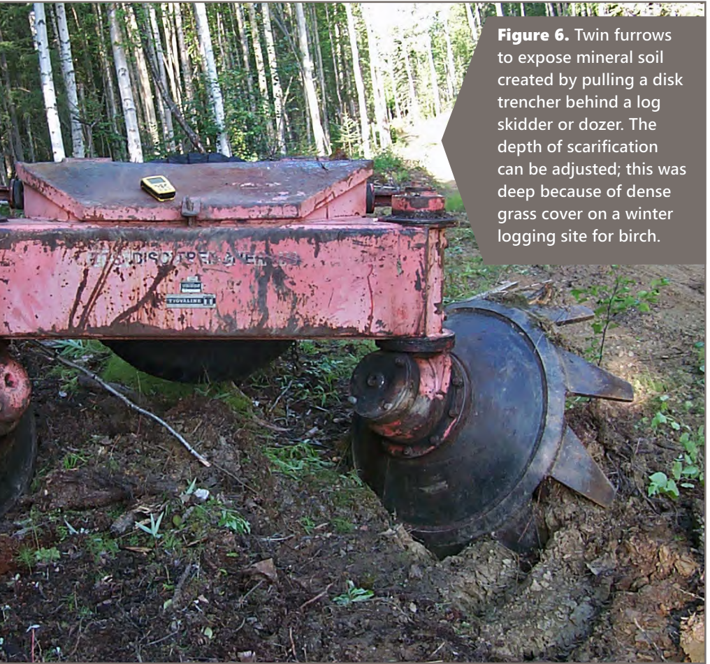
Figure 6. Twin furrows to expose mineral soil created by pulling a disk trencher behind a log skidder or dozer. The depth of scarification can be adjusted; this was deep because of dense grass cover on a winter logging site for birch.

Early summer chopping benefits aspen and willows, while fall chopping benefits paper birch and white spruce. Leaving some dead trees or snags in an area may pose little fire risk and serve important habitat needs (see “Managing for old forest habitat” in next section).