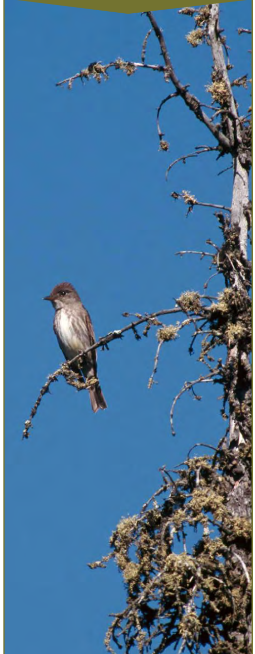
Figure 13. Olive-sided flycatcher using the top of a spruce snag as a perch for hunting insects.

Woody debris such as stumps, root wads, blowdown and larger debris should be left in place unless piling or salvage is approved by the forester to enhance operational efficiency during harvest or site preparation. If debris must be moved, scattered large piles provide maternal den potential for lynx, marten, and other predators of hares (which girdle young trees). Scattered small debris provides security cover in order for the most common small mammal (red-backed vole) to move across harvested sites and drop feces. These feces re-inoculate soils with spores of mycorrhizal fungi that interact with fine roots and ultimately enhance tree seedling health and growth.