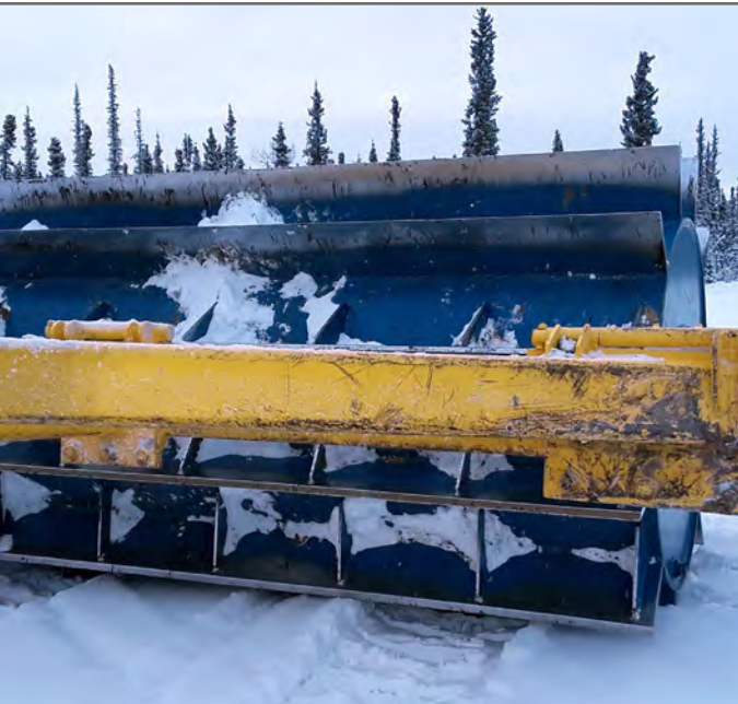
Figure 3. A roller chopper drum is filled with glycol anti-freeze for maximum weight to aid crushing and chopping force. The device stimulates the sprouting of willows and young aspen while breaking smaller debris and forcing contact with the ground to aid decomposition. Operators have mixed opinions about whether sharpening the cutter blades to increase cutting performance is worth the effort.

Where risk of soil erosion is low, scarification by machinery can expose mineral soil for germination of naturally-dispersed seeds, potentially increasing species diversity of plants, which also supports a diversity of wildlife. Exposed soil also creates planting sites for seedlings to alter species composition for specific benefits over a few decades, such as planting conifers on a deciduous site to create future timber, or allowing seed from deciduous trees and shrubs to germinate on a conifer dominated site to lower fire risk.