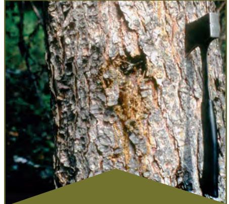
Fig. 12. Punk knots on white spruce ( upper : exposed with a hatchet, lower : weeping punk knot). Weeping punk knots indicate substantial defect (white pocket rot) that results in poor lumber quality. Harvesting infected trees in timber sales represents wasted logging effort and lost potential for future cavity trees that are important to wildlife.