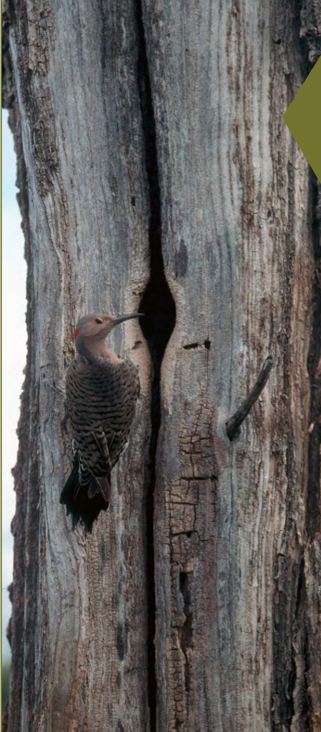
Figure 8. Northern Flicker at a cavity entrance in aspen snag. Flickers are a primary excavator of cavities in boreal forest, producing nest or den habitat for many other birds and mammals.