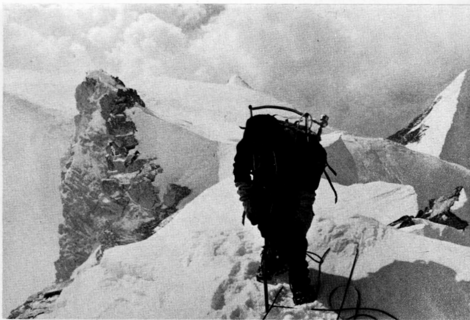
34 Looking back down the route.