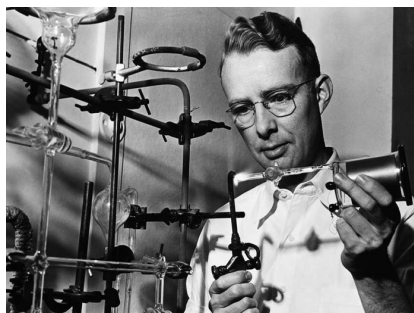
Luis Walter Alvarez, elected 1958.

Election: 2018, Fellow Affiliation at election: University of Chicago Residence at election: Chicago, IL Career description: Economist; Educator Current affiliation: Same