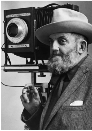
Ansel Easton Adams, elected 1966.

Adams, Ansel Easton (1902-1984) Election: 1966, Fellow Affiliation at election: Carmel, CA Residence at election: Carmel, CA Career description: Artist (photographer); Educator