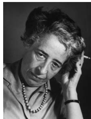
Hannah Arendt, elected 1962.