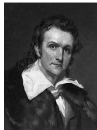
John James Audubon, elected 1830.