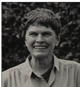
Above: Still shots from the Julia Robinson movie. Top to bottom: Julia at 3, as a young woman, and shortly before her death.