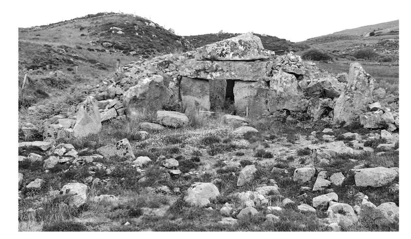
Plate 164. Shalwy (Dg. 113), from north-east.