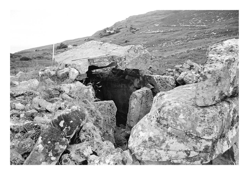
Plate 166. Shalwy (Dg. 113). View into inner chamber from east.

Heavy slabs have been used as corbels along the sides and back of the gallery, and the excavator has suggested that some large slabs found when excavating the front chamber may have been displaced corbels (Flanagan 1969, 18). Three corbels rest on the front orthostat on the N side of the gallery. The outermost measures 0.55m by 0.55m and is 0.25m thick. Only the inner end of this corbel appears on the relevant sectional drawing, as it is largely concealed by the lintels above the entrance jambs. The outer ends of the next two corbels