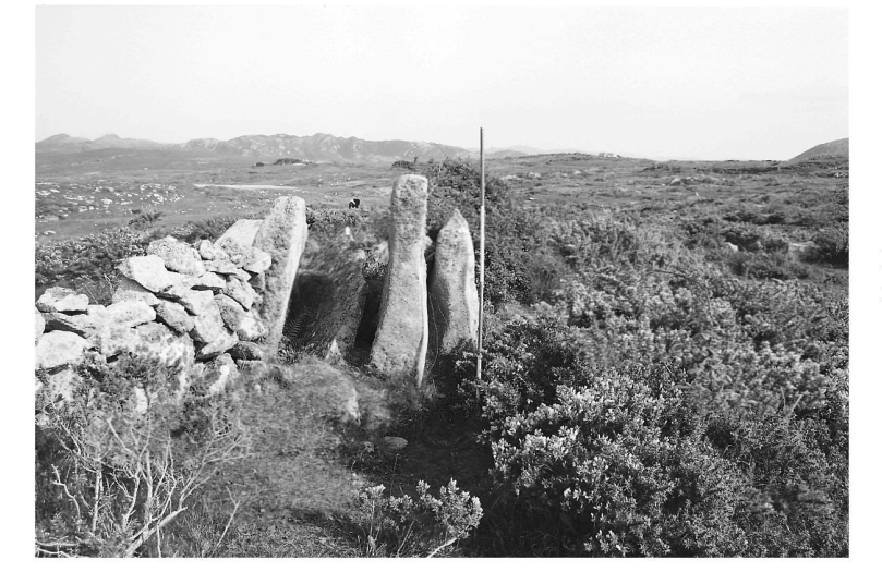
Plate 177. Tonbane Glebe (Dg. 122), from north-west.

The western entrance stone is 1.5m high. The top of this stone dips toward the back of the chamber. The eastern stone is 1.4m high. The top of this stone also dips toward the back of the chamber. The large sidestone at the E, though free standing, leans inward slightly. It measures 1.2m in maximum height. It reaches this height at mid-length, from where it falls gradually in both directions to 0.3m at the N and to present ground level at the