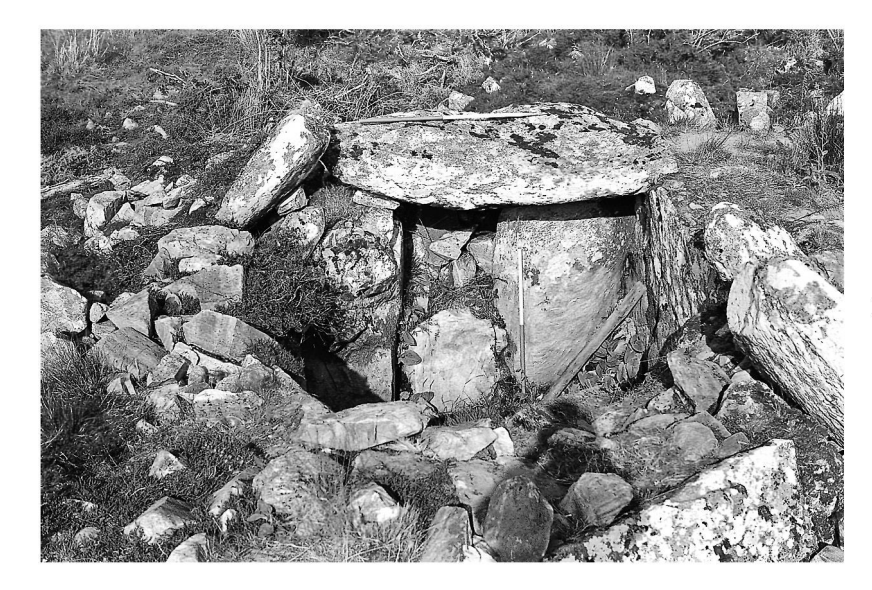
Plate 173. Tawlaght (Dg. 118). Entrance to gallery viewed from west.