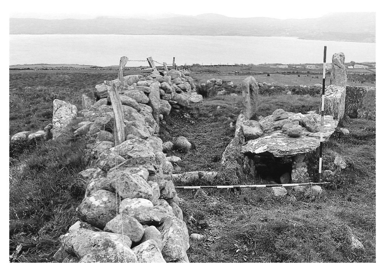
Plate 168. Sharagore/Tonduff (Dg. 114), from north-east.