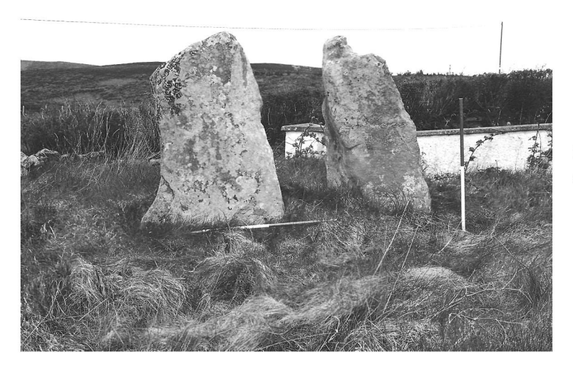
Plate 171. Stroove (Dg. 117), from south-south-east.

The orientation of the gallery is not indicated on the sketch but can be gauged from the position of the two surviving stones. It lay open to the ENE, its northern and southern sides apparently parallel and of equal length, with a backstone, rounded in profile, at the WSW. Two stones formed the S side of the structure, and four the N side. The outer two stones at the N side are the two described above. Comparison of the outline of these stones with their depiction on the OS sketch indicates that the top of the eastern one has been damaged in the intervening period. It is also clear from the sketch that the extant stones were considerably taller than the other structural stones. The sketch lacks a scale, but it is clear that together the surviving stones represented half the length of the gallery, which can thus be calculated to have been c. 5m. Only the two stones now visible were apparent by 1900, according to an OS 1:2,500 Name Book of that year. Colhoun (1995) noted some loose stones