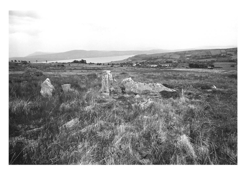
Plate 176. Tirlaydan (Dg. 121), from west.

Approximately 2m S of the entrance jamb two orthostats of the W side of the gallery survive. The southern one leans inward and is 0.8m high. Its sloping outer face is well suited to bear corbels. The second stone here is flat-topped and 1.4m high. Opposite this is the only surviving stone of the E side of the gallery. It is 1m high. The top seems broken, so it may originally have been taller. The southern end of this stone and the stone opposite are 1.8m apart, but they converge on each other toward the N, where they are 1.2m apart. These stones may have served as segmenting jambs. If so, this would suggest that the gallery consisted of at least two chambers. A