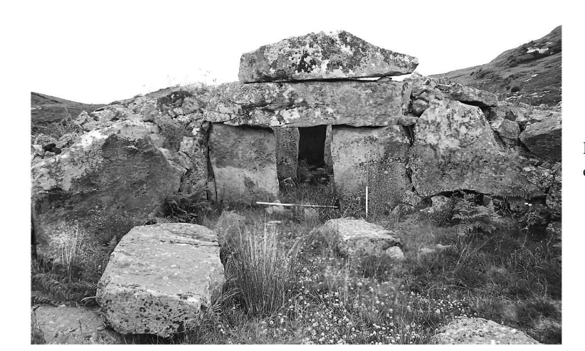
Plate 165. Shalwy (Dg. 113). From northeast showing doubled lintel.

dry-walling survive at intervals along both sides, to a height of 0.9m. The western extremity of the cairn had been largely robbed, but traces of dry-walling, no longer apparent, were noted there during the excavation. A slight drop in ground level indicates the cairn perimeter in this area now.