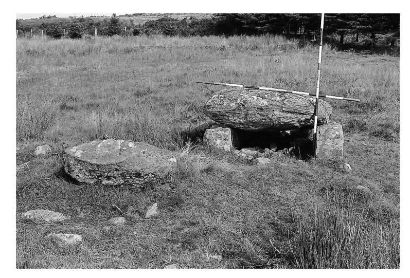
Plate 174. Tawlaght (Dg. 119), from south.