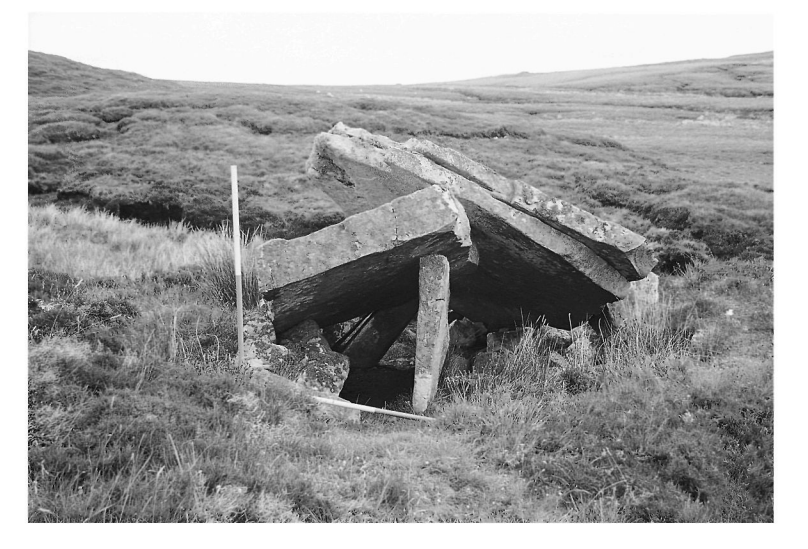
Plate 170. Straleel North (Dg. 116), from west.

The portal stone is 0.8m long, was 0.4m thick when intact, and is 1m high at its inner face. The sidestone beside it leans inward. It is 0.9m long and 0.2m thick and would stand at least 0.6m high if upright. The southern sidestone is 0.9m high. The subsidiary roofstone, now in a sloping position because of the inward lean of the