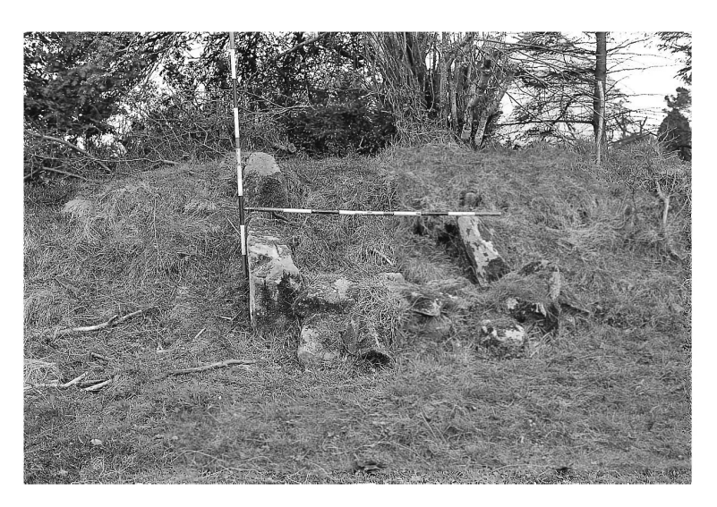
Plate 181. Tromaty (Dg. 124), from north-north-east.

This greatly ruined monument is incorporated in an earthen field fence. Two opposed orthostats, 1.4m apart and aligned NNE–SSW, protrude from the northern face of the fence. Immediately S of each a partly concealed stone rises above the top of the earthen bank. The orthostat to the E is 1.1m high. That to the W is 0.6m high. The eastern one of the two partly concealed stones rises 0.4m above the slope of the earthen bank and 0.3m above the adjoining orthostat. The western stone is almost wholly concealed. It rises only 0.15m above the top of the