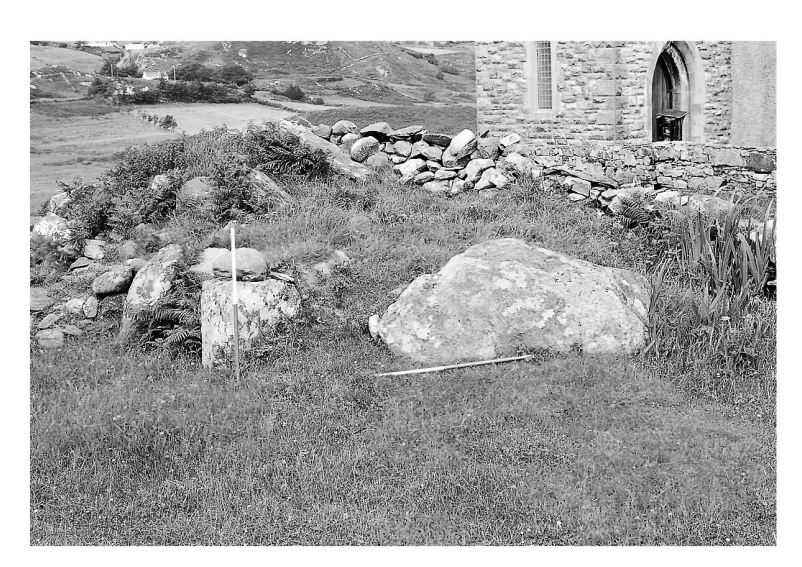
Plate 169. Straid or Glebe (Dg. 115), from south-south-west.

There are three stones close to the western edge of the mound. The southernmost, a set stone, is 0.5m NW of the southern orthostat. It measures 1.1m by 0.6m by 0.7m in exposed height at its western face. The second, 0.4m to the N, lies against the edge of the mound and measures 0.95m by 0.4m by 0.8m high. The third, 2.5m N of the second, is a set stone at right angles to the line of the other two and measures 1.05m by 0.55m by 1.2m high at its western face. A displaced slab measuring 2.15m by 1.4m lies prostrate at the N end of the mound.