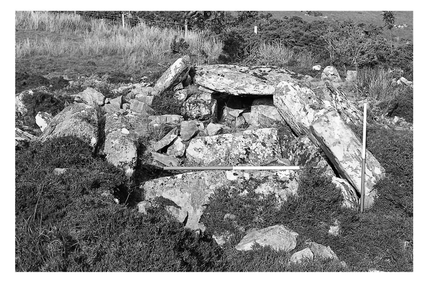
Plate 172. Tawlaght (Dg. 118), from west. Horizontal ranging-pole on backstone.

The top of the first orthostat on the N side of the gallery, like its counterpart on the S side, is hidden by peat and sod-grown cairn material. It is 0.9m in exposed height. The second orthostat is set askew to the end of the last so as to narrow the chamber, and its inner end is concealed by fill. This is also 0.9m in exposed height. Beyond this stone and inside the line of the gallery the uppermost 0.1m of a flat-topped stone rises clear of the fill. It is the same height as the two orthostats. The status of this stone (not hatched on plan) is not clear. Immediately W of it a displaced slab rising from the fill lies across the gallery. This measures 1.1m by at least 0.6m and is at least 0.1m thick. North of this the faces of two separate stones are exposed at the side of the gallery. Both are around the same height as the orthostats on this side, but it is unclear whether they are structural stones, and they are not hatched on the plan. Beyond these are two sidestones. These match the two on the S side in that they are disposed so as to widen the gallery before narrowing it again toward the backstone. These are of about equal height. Both rise 0.55m above the fill in the gallery.