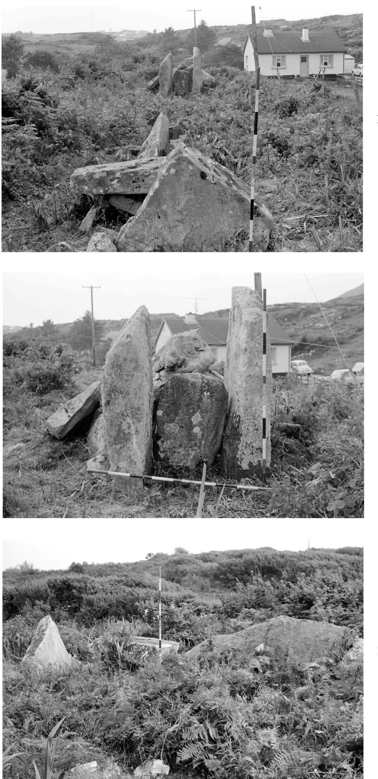
Plate 178. Toome (Dg. 123), from east.