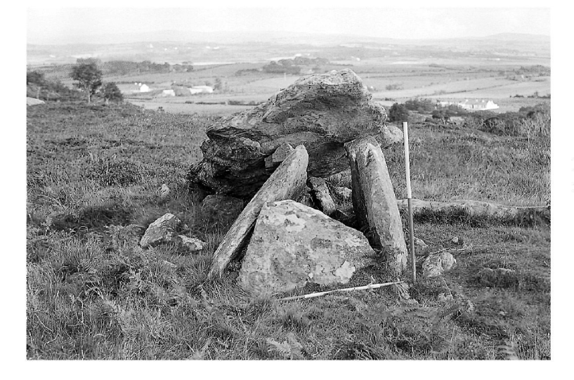
Plate 175. Templemoyle (Dg. 120), from north-west.

The tomb consists of a small SE-facing chamber, the front of which has collapsed. The chamber was at least 1.8m long and is 1m wide at the rear. A backstone at the NW and two opposed sidestones are in place. A displaced roofstone, its front end resting on the ground, is supported on the outer end of the southern sidestone and on a small stone (not on plan) on top of the northern sidestone. A prostrate stone in front of the southern sidestone appears to be a displaced portal-stone. It measures 2m by 0.65m by 0.2m thick. This seems to be the stone referred to in an OS Revision Name Book (1848) as 'an upright stone 4 feet [c. 1.2m] high which appears to have originally supported the covering stone but having leaned a little toward the south by some unknown cause leaves one end of the covering stone resting on the ground'. Some loose stones (not on plan) lie in the chamber.