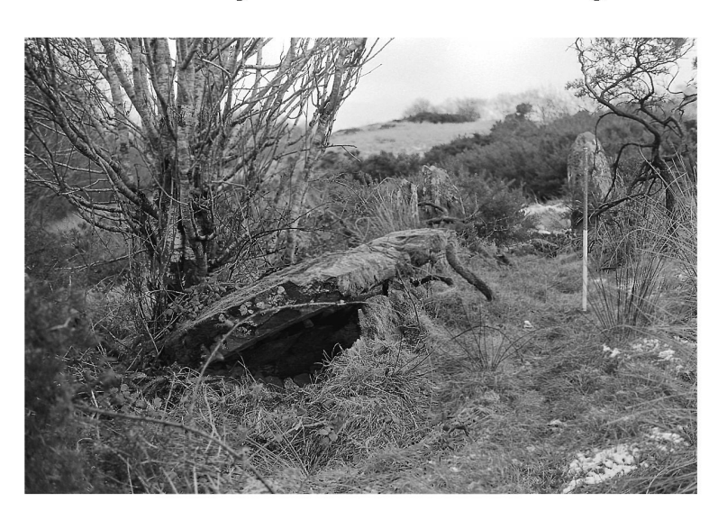
Plate 182. Crislaghmore (Dg. 125), from west-south-west.

The stone crossing the E end of the gallery is 0.35m high. The southern one of the two opposed sidestones next to this is 1.4m high. The northern sidestone is 1.1m high. The sidestone next to this is 0.9m high. The stone