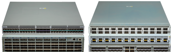
Arista 7280R3 Series

7280R3 support for 100G QSFP incorporates a flexible choice of interface speed including 25G and 50G providing unparalleled flexibility and the ability to seamlessly transition data centers to the next generation of Ethernet performance. The 7280R3 Series provide industry leading power efficiency with airflow choices for back to front, or front to back. An optional built-in SSD supports advanced logging, data captures and other services directly on the switch. Combined with Arista EOS the 7280R3 Series delivers advanced features for big data, cloud, virtualized and traditional designs.