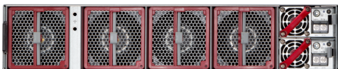
Arista 7280R3 2RU Rear View: Front to Rear airflow (red) DC Powered