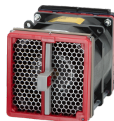
2U Hot swap fan modules