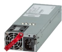
2.4kW Hot swap power supplies