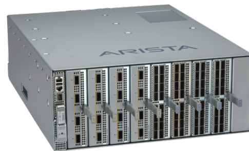
Arista 7368X4: 128 ports of 25G or 100G, or 32 ports of 400G

Combined with Arista EOS the 7368X4 series deliver advanced features for hyper-scale networks, server-less compute, big data farms and machine learning clusters.