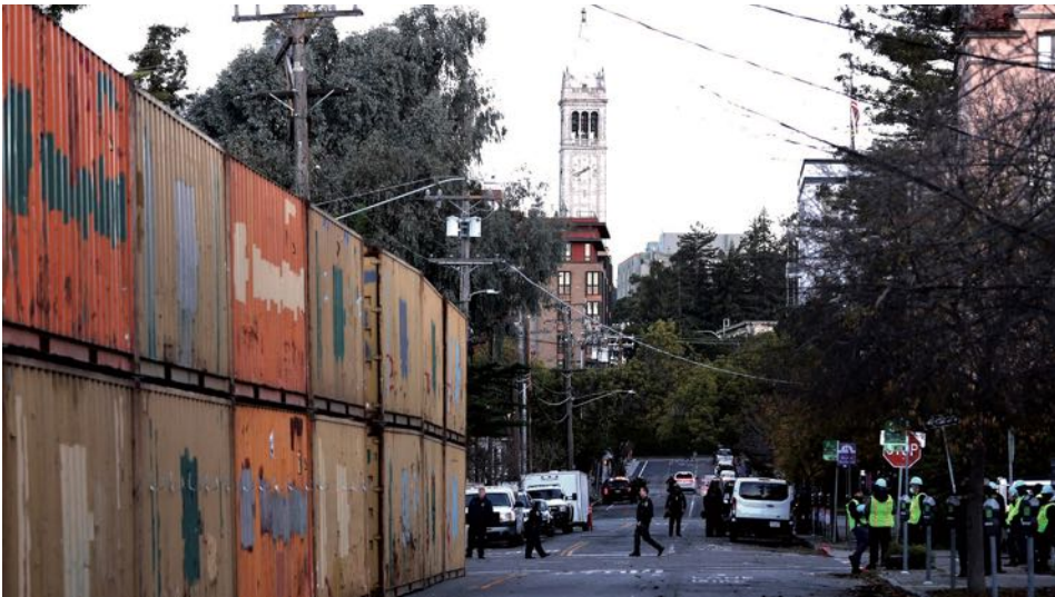
THANK HEAVENS THE OFFENSIVE TREES AND FLOWERS are now safely tucked behind a wall of mostly blue and gold cargo containers symbolizing a new era of looking like a trainyard.