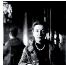
PAULINE KAEL, CELEBRATED BERKELEY FILM CRITIC wrote for the New Yorker from 1968 to 1991 and would have been shocked to watch the death of movie theaters in Berkeley which are now considered 'passe' with Facebook and Twitter and all.

"I'm in good shape, but I'm not biking home in the dark from a movie," acknowledged another Berkeley resident. "They have a downtown lined with empty high-end condos and student dorms that haven't made any dent in the worsening need for tent cities. As far as I'm concerned not enough of the