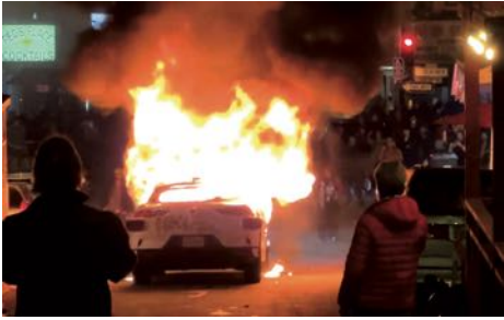
POLICE TRIED TO BLAME A NEARBY CROWD for a Waymo vehicle on fire but the car stated that it was just part of a lunar new year celebration with fireworks that got out of hand.