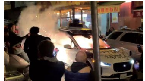
REVELERS ASSUMED the Waymo bonfire was just a part of local Superbowl festivities.

Next Issue: dancing on shipping containers with celebrities!