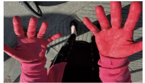
PEOPLE ON THE FRONT LINES have this conflict firmly in focus while others are flipping madly through a thesaurus.