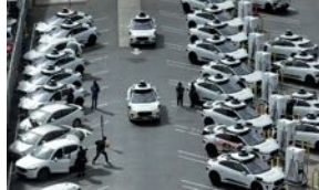
THE WHOLE WAYMO FLEET is under suspicion now after one Waymo vehicle burst into flames in celebration of maybe Mardi Gras.

"We expect more of our autonomous mode," muttered one Waymo staff member. "We at least expect our products not to burst into flames."