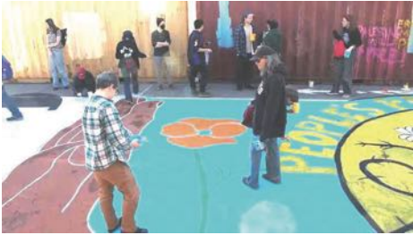
A STREET PAINTING PARTY brought neighbors out to do what they can to address the blight of the university's weird shipping containers.