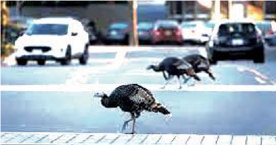
CAREFULLY CHOREOGRAPHED RAFTERS OF TURKEYS blocked traffic nationwide in an effort to convey their support the the inevitable Republican nominee.