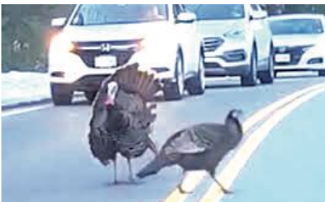
TURKEYS PUT THEIR LIVES AT RISK with these demonstrations after hearing that most nominees for the Republicans are promising to pass around pardons like popcorn.

Turkey spokesbirds object to this selfish characterization, pointing out that the main reason most Republicans support the former president is that they are basically "not receptive" to the Department of Justice's accusations of the Republican candidate in the forefront of the race and that they,