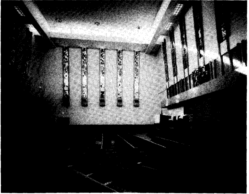
Congregation Adath Israel after the introduction of mixed seating.

the other side of the first floor of the Synagogue without any curtain or any partition between them.” 83 In 1923, apparently in reaction to liberalization moves in many Conservative synagogues, members voted an amendment to their constitution: “that no family pews be established nor may men remove their hats during services; that no organ be used during services; that no female choir be permitted so long as ten (10) members in good standing object thereto.” 84