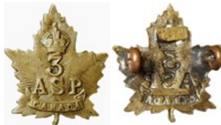
70-1-12-144 Collar Brass. J.R. Gaunt Maker tab