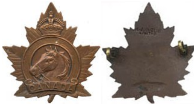
70-1-11-126 Cap Copper. Modified motto erased. Flat back maker marked R.J. Inglis Limited