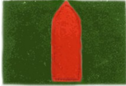
Formation Patch Red shell on dark green rectangle