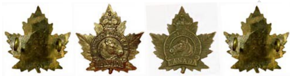
70-1-12-122 Collar Pickled. Maker marked R.J. Inglis Limited