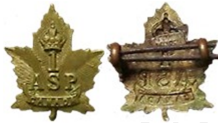
70-1-12-134 Collar Brass. J.R. Gaunt Maker tab