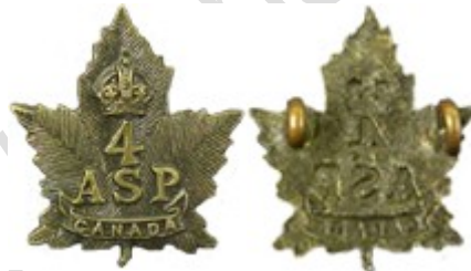
70-1-12-150 Collar Brass. Small framed 'CANADA'. Not maker marked