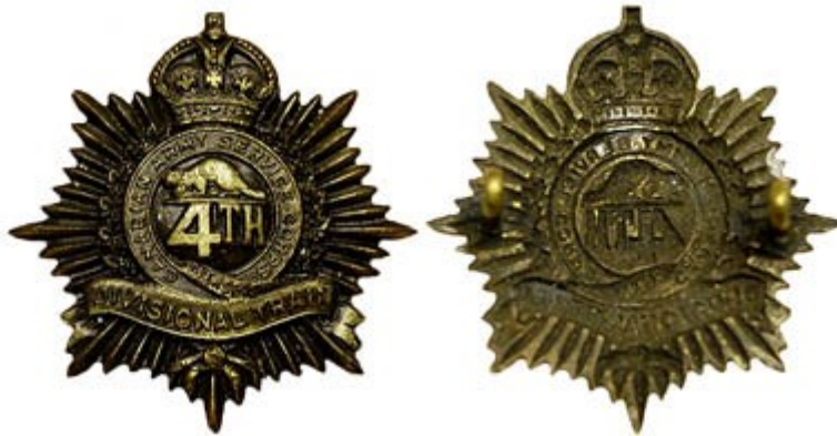
70-1-11-146 Cap Pickled finish.