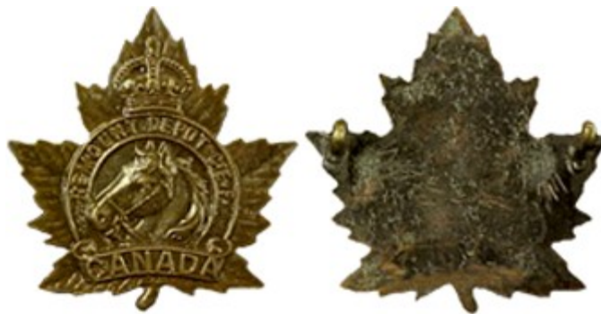
70-1-11-122 Cap Pickled gilding metal. Maker marked R.J. Inglis Limited