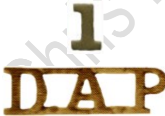
70-1-14-134 Title Gilding metal. Lug fasteners. By Tiptaft. Not maker marked