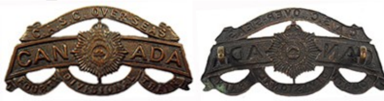
70-1-14-146 Title Brown finish