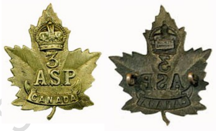
70-1-11-144 Cap Brass. With J.R. Gaunt London makers tab