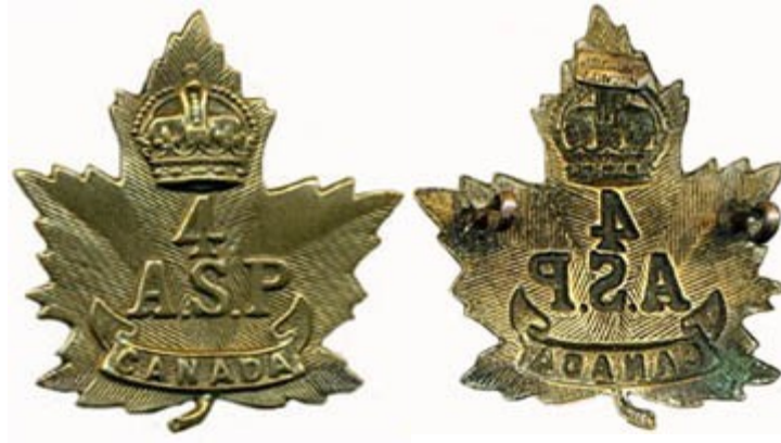
70-1-11-148 Cap Brass. With J.R. Gaunt London makers tab