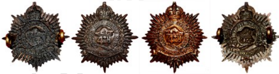
70-1-12-146 Collar Brown finish