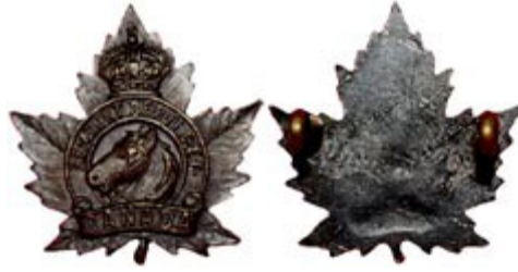
70-1-12-124 Collar Blackened. Not maker marked