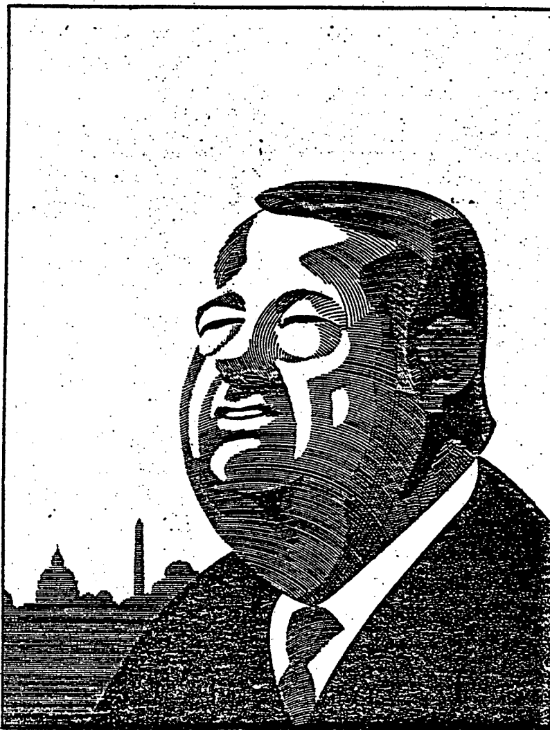
DRAWING OF ED MEESE