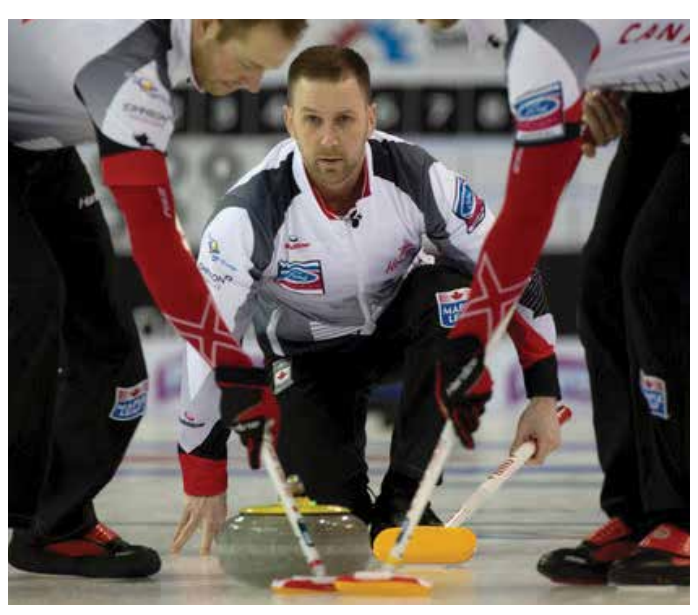
Canada's Brad Gushue went through the 2017 world men's curling championship with a perfect 13-0 record. There have been other unbeaten records, but none better than this.