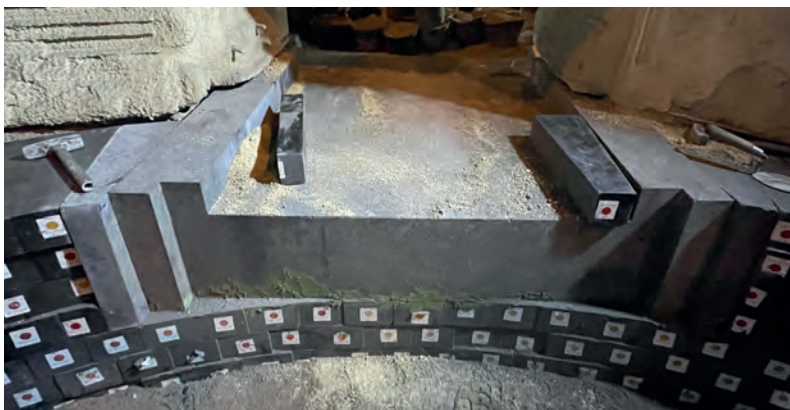
Fig. 6 Slagdoor installed

Mayerton offers supportive, adaptable and forward-thinking partnerships. Our team is always asking, “what more can we do?” and arriving at new concepts to enhance refractory performance. From new design ideas to the streamlining of systems, our team is always pushing the boundaries of what is possible. For example, our techni-