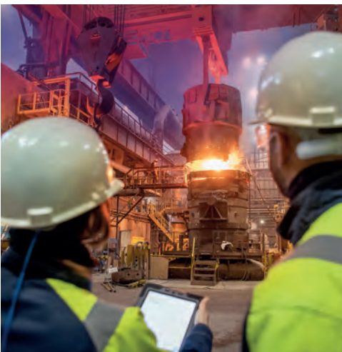
Fig. 4 Steel casting ladle

Whilst EAF production is focused on recycling rather than extraction and is more