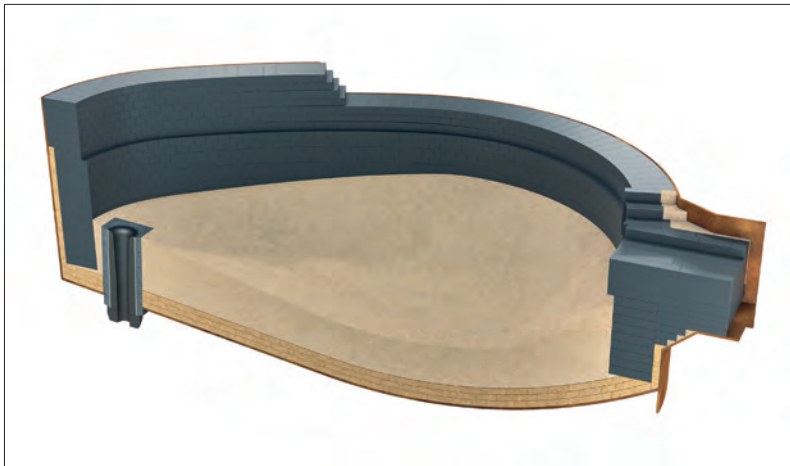
Fig. 2 Electric Arc Furnace (EAF)