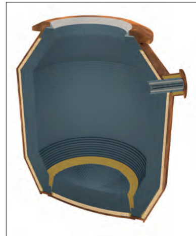
Fig. 3 Basic Oxygen Furnace (BOF)

CB: Mayerton is supporting customers to decarbonize the steelmaking process through our Sustainability Roadmap for a greener future. A key initiative for our customers is the reduction of the refractory CO 2 emitted per tonne of liquid steel.