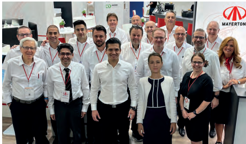
Fig. 7 Mayerton team at METEC Trade Fair, Düsseldorf 2023