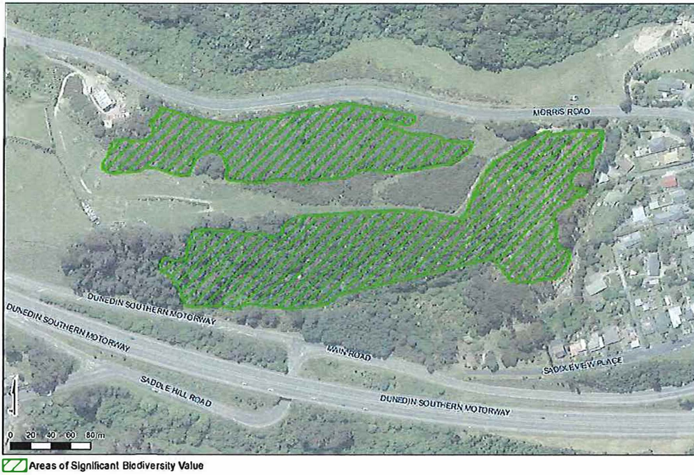
Figure 2: Map showing location of new ASBV areas on 81 Morris Road