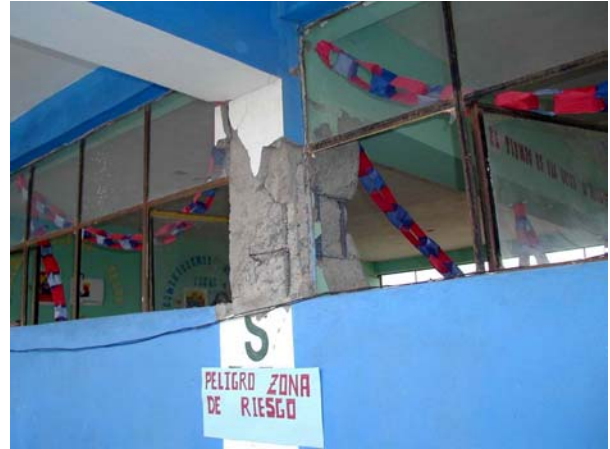
Figure 25. One of the failed columns at school shown in Figure 24. No special reinforcement in the short-column area; wide spacing of transverse reinforcement.