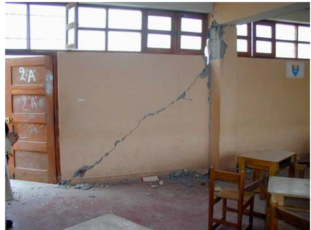
Figure 27. Another short column condition at school shown in Figure 26. Damage to both masonry infill and to short column.