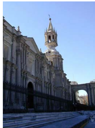
Figures 12 and 13. The precarious tower is supported by four 35 cm by 35 cm concrete columns and four steel rails. One of the steel rails buckled. Arches attached to the main structure were also damaged.