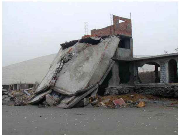
Figure 23. Tsunami damage near Camaná; foundation failure. Note the undamaged wall at top story indicating relatively weak ground shaking.