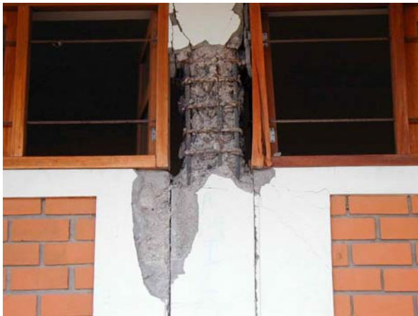
Figure 26. Short column at another school in Camaná. Even #3 at 4 in. o.c. transverse reinforcement did not prevent heavy damage.