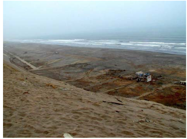
Figure 19. Tsunami swept away wooden summer houses over a 10 Km stretch of coastline between Camaná and Ocoña. Note the barren streets remaining.