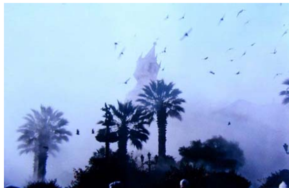
Figure 7. Cathedral of Arequipa, subsequent still photo showing impending collapse of left tower shown in Figure 6.