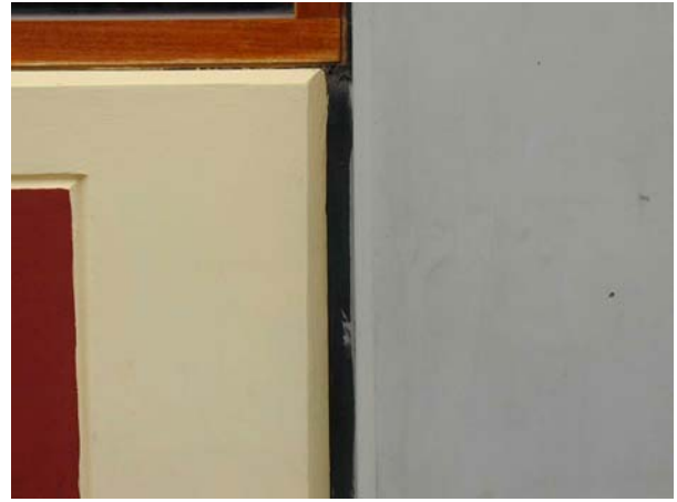
Figure 29. The walls were separated from the reinforced concrete frames by an elastomeric material to avoid short-column configuration.