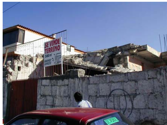
Figure 16. Typical historic dwellings with vaulted roof.