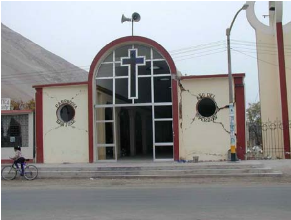
Figures 30 and 31. Church in Ocoña built using very poor construction materials; both the mortar and brick were weak. Previously damaged and patched following earthquake 4 years ago.

In Ocoña, a small city near the coast to the northwest of Camaná, mainly adobe houses sustained damage. Field observations indicate that the city experienced relatively low ground shaking.