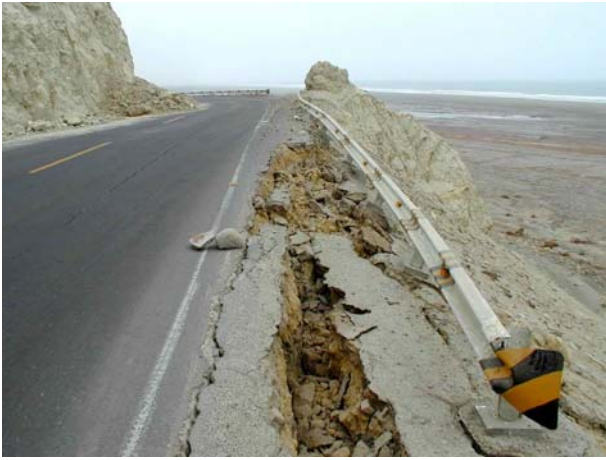
Figure 18. The Pan-American Highway south of Camaná sustained damage; no warning signs posted.