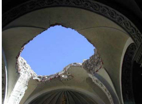
Figures 8, 9, 10, 11. Cathedral of Arequipa. [Clockwise starting above] View from the main square (Plaza de Armas); view from the roof; bent rails used to support the upper tower; collapsed tower punctured the vaulted dome above the main altar.