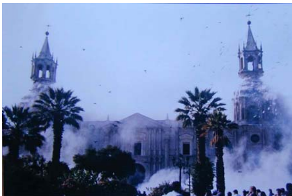
Figure 6. Cathedral of Arequipa, first still photo from sequence taken during main event on 23 June 2001.

A set of still photos extracted from a video recording taken during the earthquake shows part of the collapse sequence of the towers at the Cathedral of Arequipa (Figures 6 and 7, photos purchased by E. Fierro). Figures 8 to 13 show details of the damage, especially to the towers.