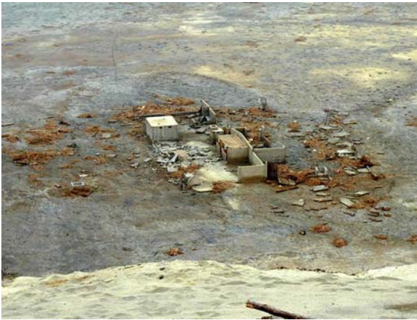
Figure 20. Tsunami damage near Camaná; wreckage remaining from masonry house damaged by tsunami.