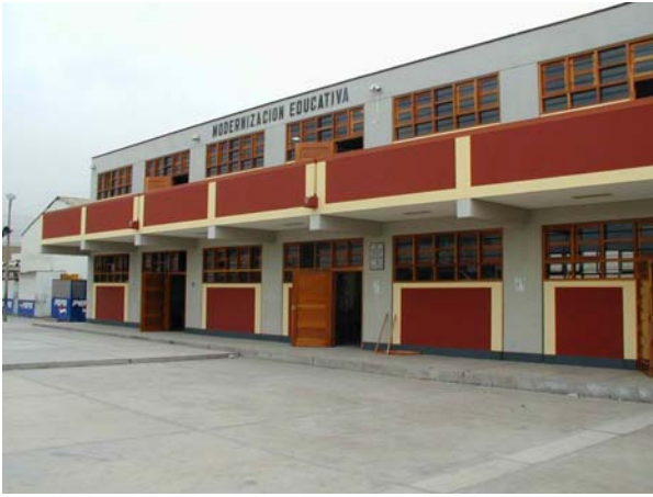
Figure 28. This school in Camaná built using the new Peruvian code did not suffer any damage.