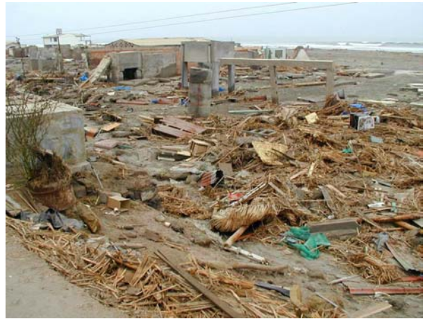
Figure 21. Tsunami damage near Camaná; about 30 Km of the coastline was heavily affected by the tsunami.