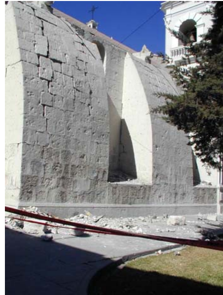
Figures 14 and 15. Church of Santa Marta; towers pulled away from the main structure. Buttresses supporting the main structure show signs of distress.

Many cathedrals and religious monuments sustained damage. The Convent of Santa Catalina, founded in 1579, was heavily damaged. Many traditional domed and vaulted structures were extensively damaged. One example of a lightly damaged vaulted ceiling in an historic home is shown in Figure 16. Many of the damaged older dwellings have roofs made with heavy blocks of low strength “sillar” (consolidated volcanic ash) supported by steel rails (Figure 17).