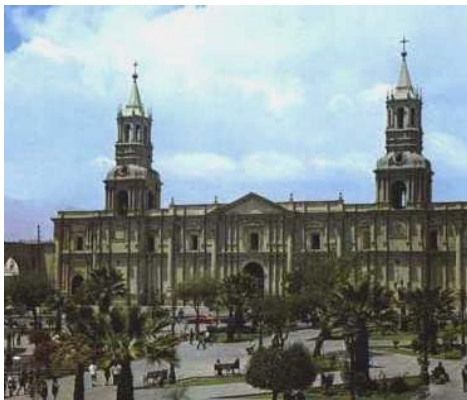
Figure 4. Cathedral of Arequipa, pre-earthquake file photo.

The city's historic Cathedral of Arequipa sustained heavy damage, mainly due to the collapse of one of its towers. The cathedral is situated on the Plaza de Armas in Arequipa's historic center, a UNESCO World Heritage site. The cathedral, founded in 1612, was damaged by previous earthquakes and fire and was substantially rebuilt in the 19th century. Both towers of the cathedral were apparently damaged in previous earthquakes and rebuilt most recently in about 1940. This cathedral is the symbol of Arequipa and an important part of the architectural heritage of Peru.