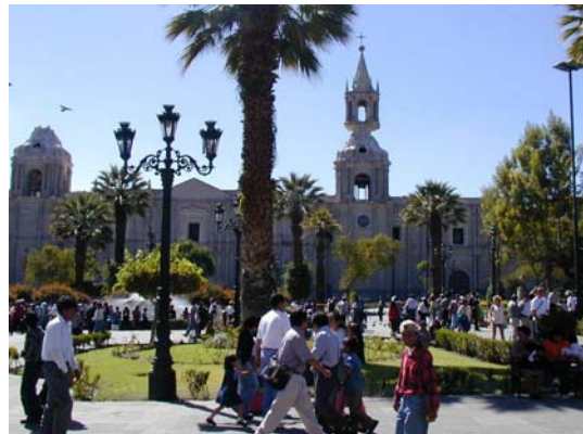
Figure 5. Cathedral of Arequipa as it appeared on June 28, 2001. (Photo by E. Fierro)

A set of still photos extracted from a video recording taken during the earthquake shows part of the collapse sequence of the towers at the Cathedral of Arequipa (Figures 6 and 7, photos purchased by E. Fierro). Figures 8 to 13 show details of the damage, especially to the towers.