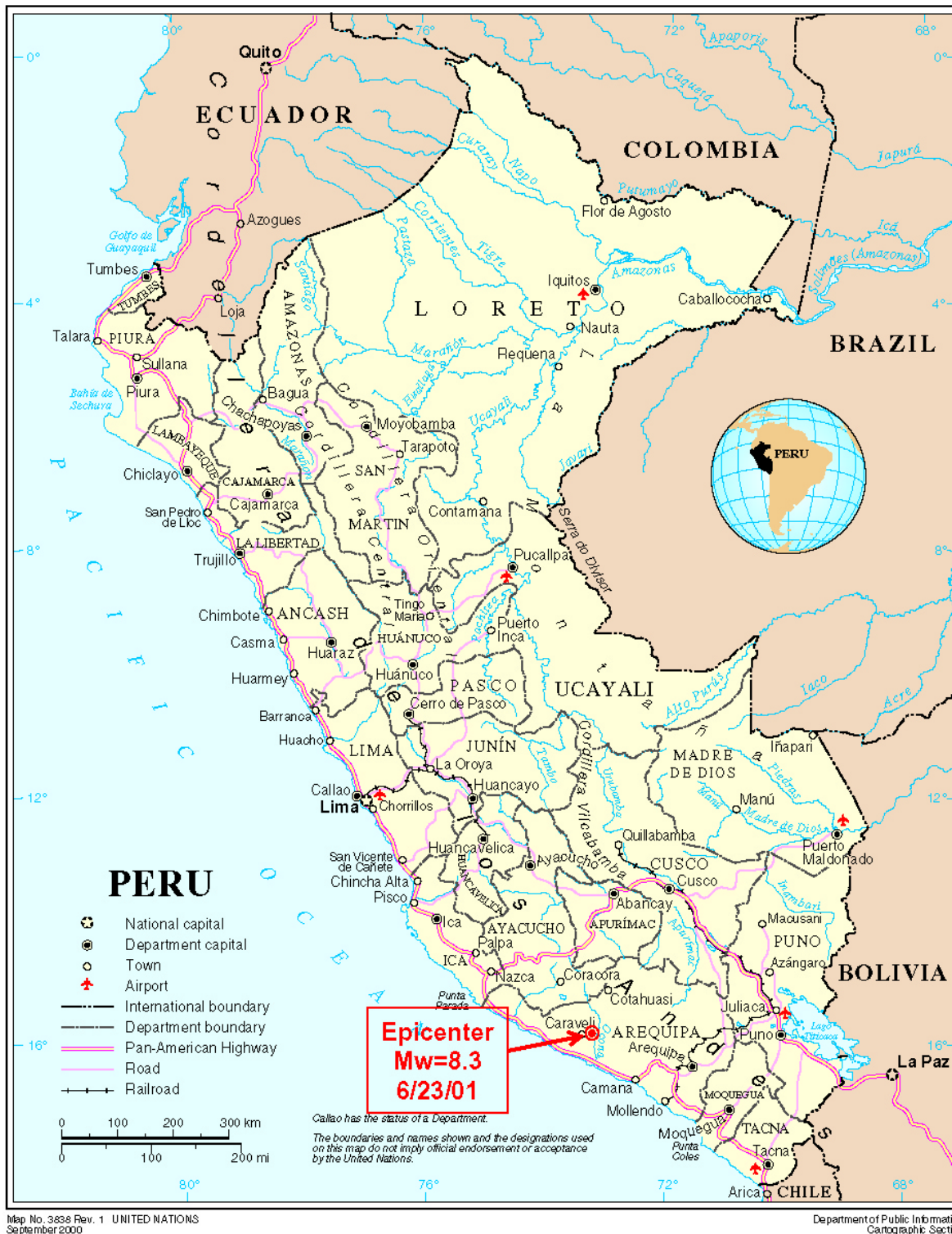
Figure 1. Map of Peru showing the epicenter location.

On June 23, 2001, at 8:33PM UTC, 3:33 PM local time, a M_w=8.3 (USGS) earthquake occurred near the coast of south-central Peru along the subduction zone between the Nazca and South American tectonic plates. The districts of Arequipa, Moquegua, Tacna, and Ayacucho sustained losses (Figures 1 and 2). This initial reconnaissance report has been prepared by Eduardo Fierro of Wiss, Janney, Elstner Associates Inc. based on his field observations from June 28th to July 3rd.