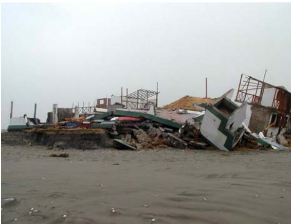
Figure 22. Tsunami damage near Camaná; collapse of beachfront property due to foundation failure.