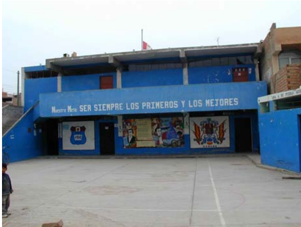
Figure 24. An old school in Camaná. Three columns failed in shear.

Downtown Camaná suffered minor damage. Primarily adobe houses and some school buildings sustained structural damage. Most of the damage could be attributed to configuration problems such as soft stories or short-column effects. Figures 24 to 27 show typical damage to old school buildings. Both new and older schools with short column problems performed poorly. Schools designed using the most recent Peruvian code had isolation details between infill masonry walls and the concrete framing and avoided the short column failures. Figures 28 and 29 show an example of the most recent school construction; the school shown in these photos performed well.