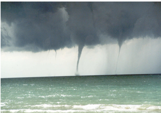
Fig. 3: Three waterspouts over Lake Huron successfully predicted using The Szilagyi Waterspout Nomogram (September 9, 1999).

The waterspout nomogram has proven itself as valid prognostic tool and is continuously being refined with the addition of new data every year. Meteorologists in North America now routinely use the nomogram to forecast waterspouts up to 2 days in advance, as was the case over Lake Huron in September 9, 1999 (Fig. 3).