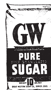
Figure 6. Great Western 10-pound bags of granulated sugar changed through the decades.