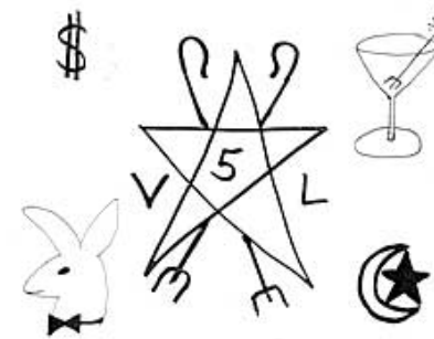
Native Vice Lords