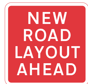
Fig. 3: Diagram 7014

Temporary traffic signs may be erected for a limited period to guide traffic to special events, such as major sporting events, shows or other public gatherings that are expected to attract large volumes of traffic. Traffic Advisory Leaflet 4/11: Temporary Traffic Signs for Special Events 6 gives advice on the circumstances in which these signs may be used, their design, construction and mounting.