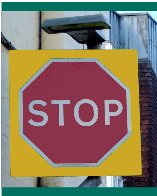
Fig. 7: Undesirable use of a backing board

If too many signs have yellow backing boards, the highlighting effect is lost.