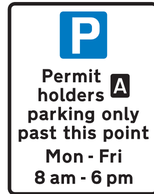
Fig. 5: Diagram 663.3

Use of restricted parking zones and 'permit holders only past this point' area-wide parking controls (fig. 5) can be an effective way of removing the need for road markings to indicate waiting restrictions and parking bays. These signs were prescribed by the 2011 amendments to TSRGD, and therefore no longer need authorisation. Local authorities in England can now also remove yellow lines from pedestrian zones where appropriate repeater signs are placed.