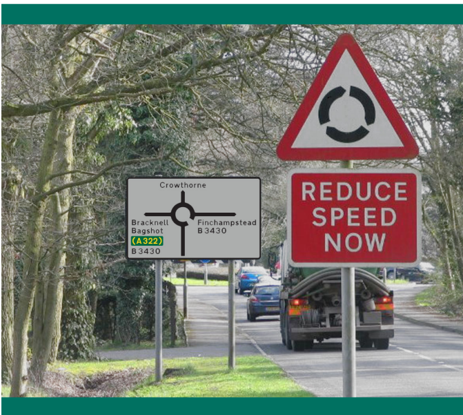
Fig. 2: Unnecessary roundabout warning sign

Local authorities should work with local communities where specific issues and concerns are raised, to make sure the right solution is found. Warning signs should only be installed where there is an identified hazard or road safety problem, and not to solely meet a perceived need.