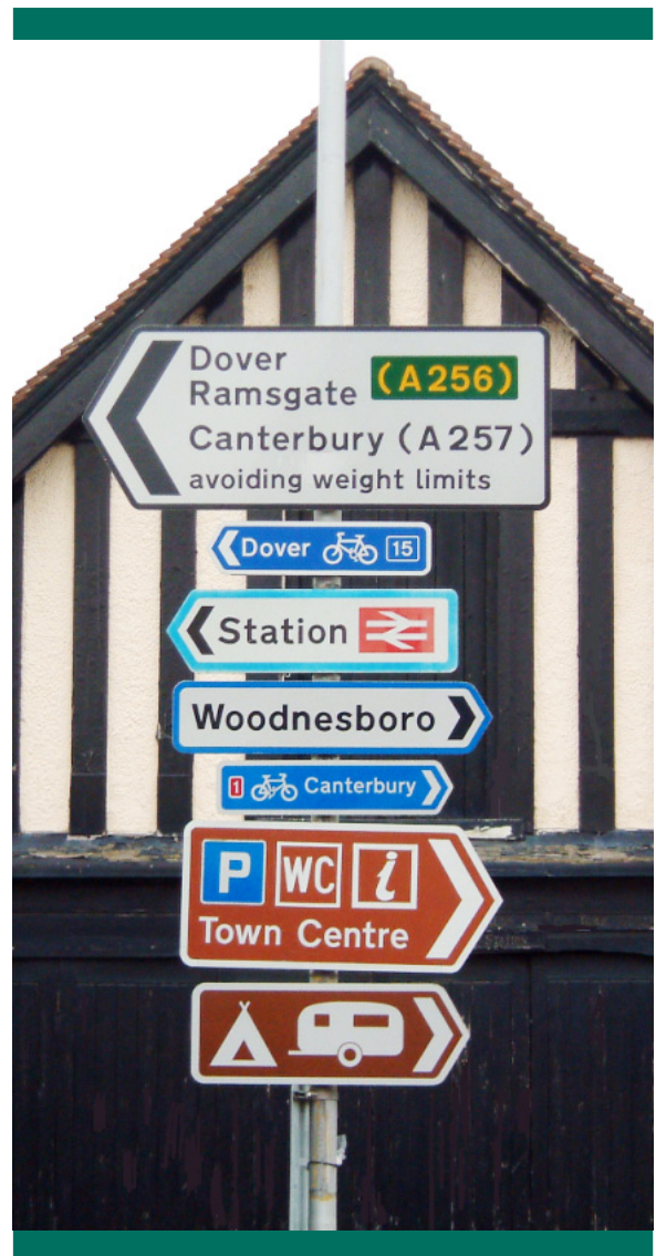
Fig. 6: Too many signs mounted untidily on one post

pedestrians. Local authorities should consider the impact of sign placement on pedestrians and vulnerable road users, and in relation to other street furniture. The recommended minimum unobstructed footway width is 2m.