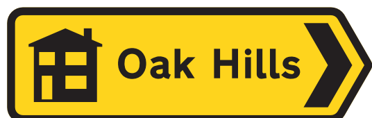
Fig. 4: Diagram 2701