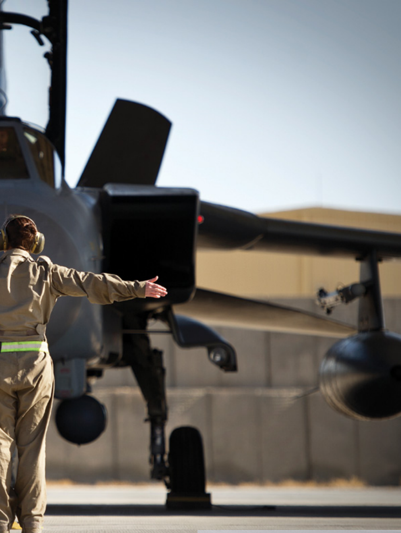
A ground crew member with the Royal Air Force is pictured marshalling a RAF Tornado GR4 ready for take off.