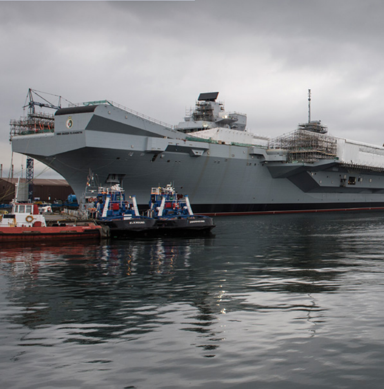
The Royal Navy's largest ever warship HMS Queen Elizabeth is gently floated out of her dock for the first time in Rosyth, Scotland.