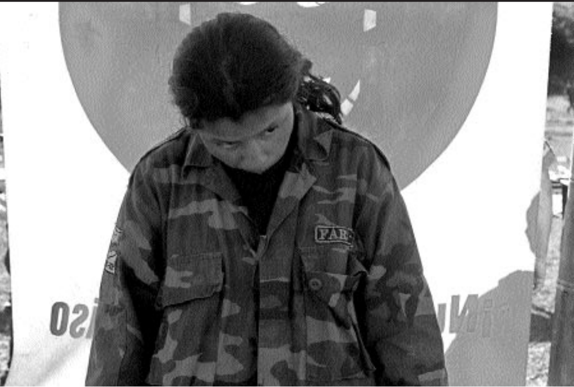
A thirteen-year-old girl is held captive by the military in La Plata, Colombia, in July 2002.