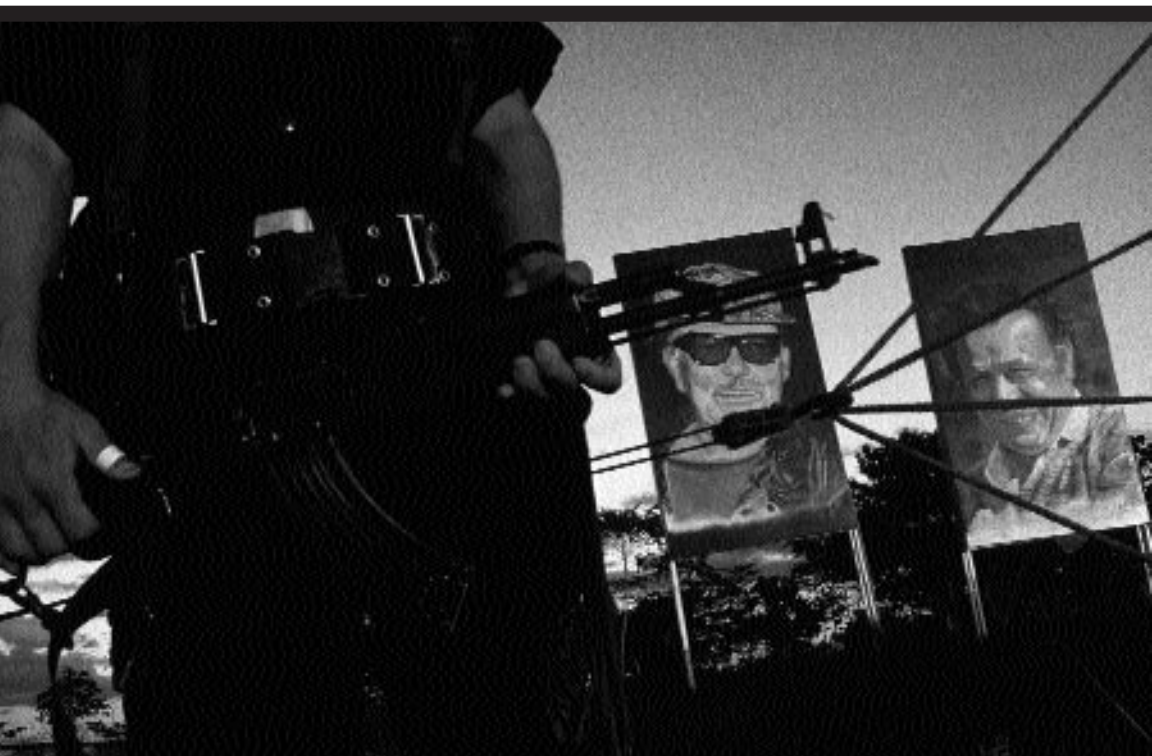
FARC-EP member standing in front of large paintings of FARC-EP founders Jacobo Arenas and Manuel Marulanda, at a compound used for peace negotiations in the Zone.