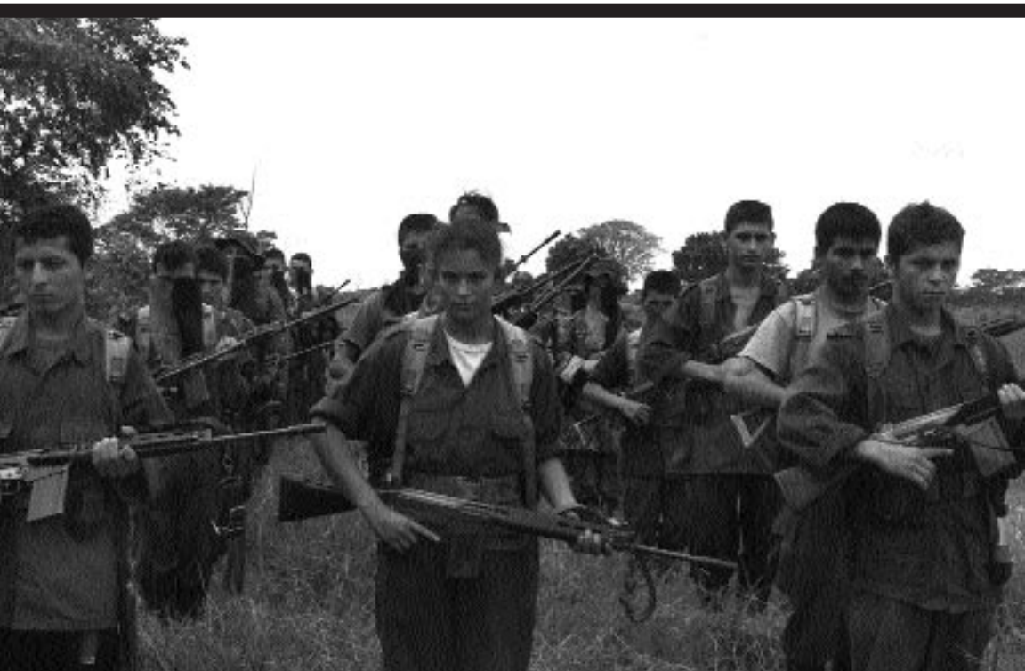
A girl stands at attention in a UC-ELN unit in Arauca in 2002.