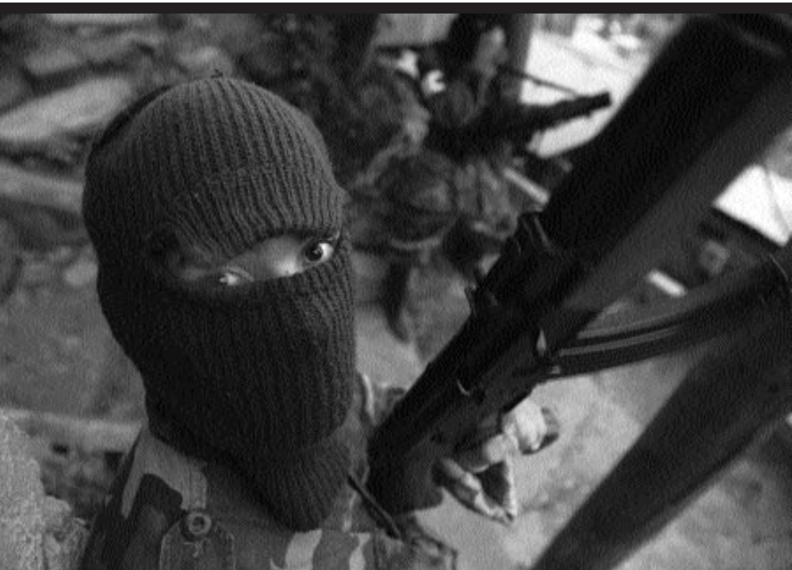
A fourteen-year-old member of the AUC in Medellin in 2002. © MARCELO SALINAS