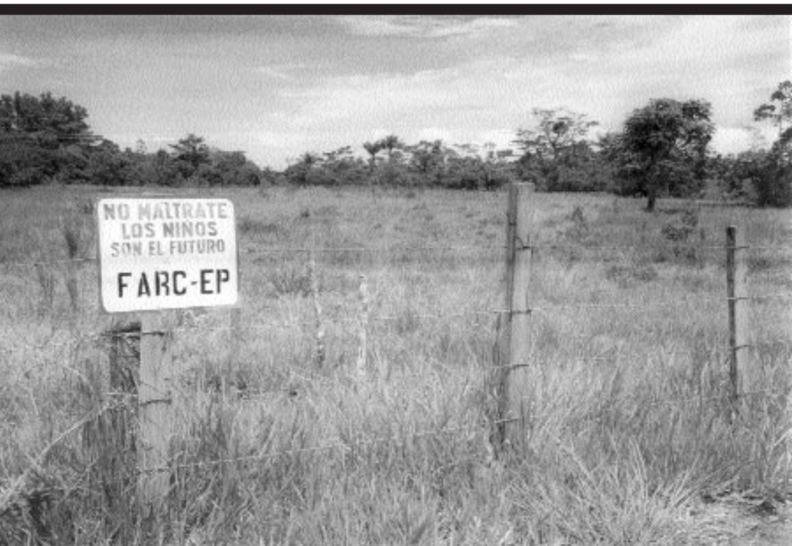
Sign posted on the outskirts of San Vicente del Caguán, the largest town within the FARC-controlled Zone, saying: “Don’t mistreat children; they are the future—FARC-EP.”