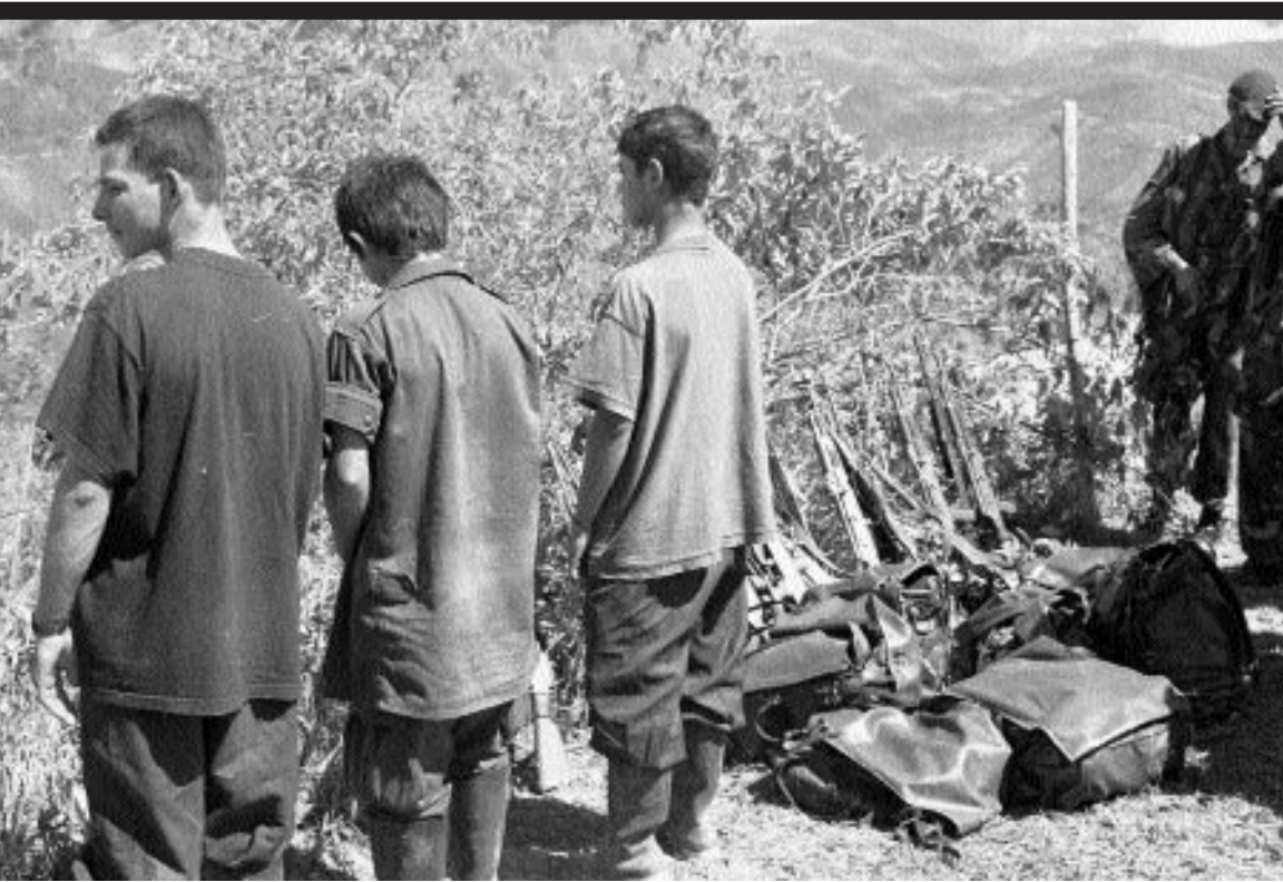
Boys with the FARC-EP captured on November 11, 2000, near the village of La Aguada, Santander, during Operation Berlin.