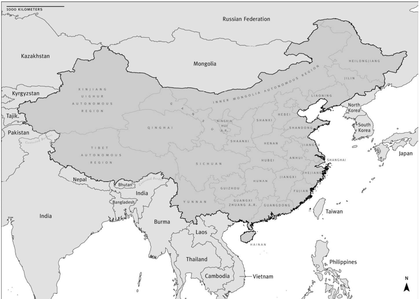
Provinces and Autonomous Regions of the People's Republic of China