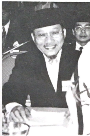
The Minister of Education, Yang Berhormat Pehin Orang Kaya Laila Wijaya Dato Seri Setia Haji Awang Abdul Aziz, at the head of the Brunei Darussalam delegation to the 30th SEAMEO Conference.

Making the call at the Thirtieth Conference of the South-East Asia Ministers of Education Council, SEAMEC, held in Kuching, Sarawak from 16-19 January, 1995, the Brunei Darussalam Education Minister, Yang Berhormat Pehin Orang Kaya Laila Wijaya Dato Seri Setia Haji Awang Abdul Aziz cited looking at market and production-oriented strategy without divorcing away from the original objective as an example of such directions and