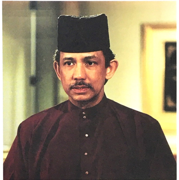
His Majesty Paduka Seri Baginda Sultan Haji Hassanal Bolkiah Mu'izzaddin Waddaulah, Sultan and Yang Di-Pertuan of Brunei Darussalam underscoring the importance of peace as a precondition of development.