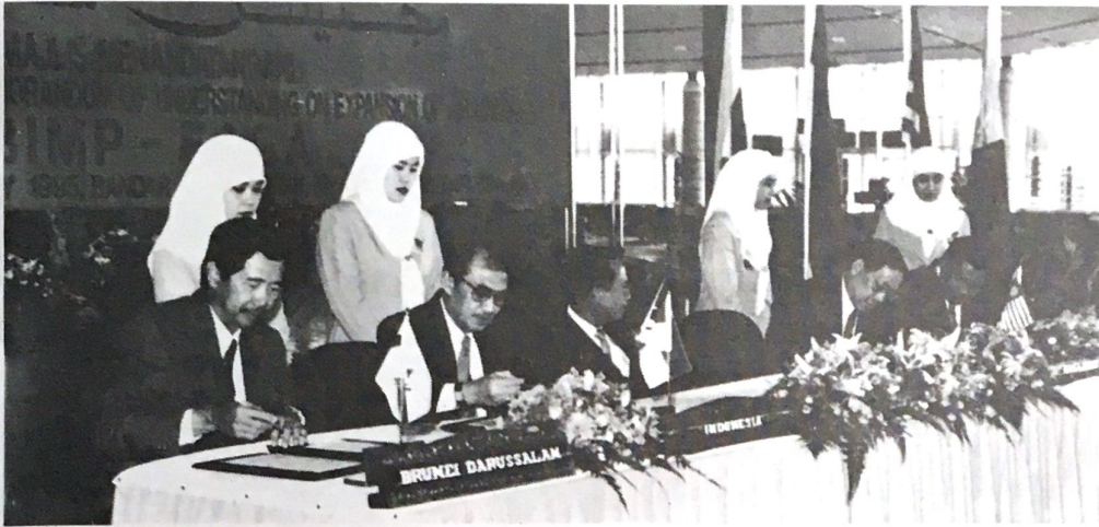
The Minister of Communications, Dato Seri Laila Jasa Awang Haji Zakaria watches as the four representatives put down their signatures on the Brunei Darussalam, Indonesia, Malaysia and the Philippines MOU on air linkages expansion.

The Minister of Communications has highlighted that the signing of the Memorandum of Understanding (MOU) between the Governments of Brunei Darussalam, Indonesia, Malaysia and the Philippines on the Expansion of Air Linkages was a significant expression of commitments of the four governments towards achieving an accelerated pace of development in the sub-region through cooperation and partnership. He also said that it marks a "significant milestone in the development of the BIMP-EAGA (Brunei Darussalam-Indonesia-Malaysia-Philippines - East ASEAN Growth Area) growth polygon.