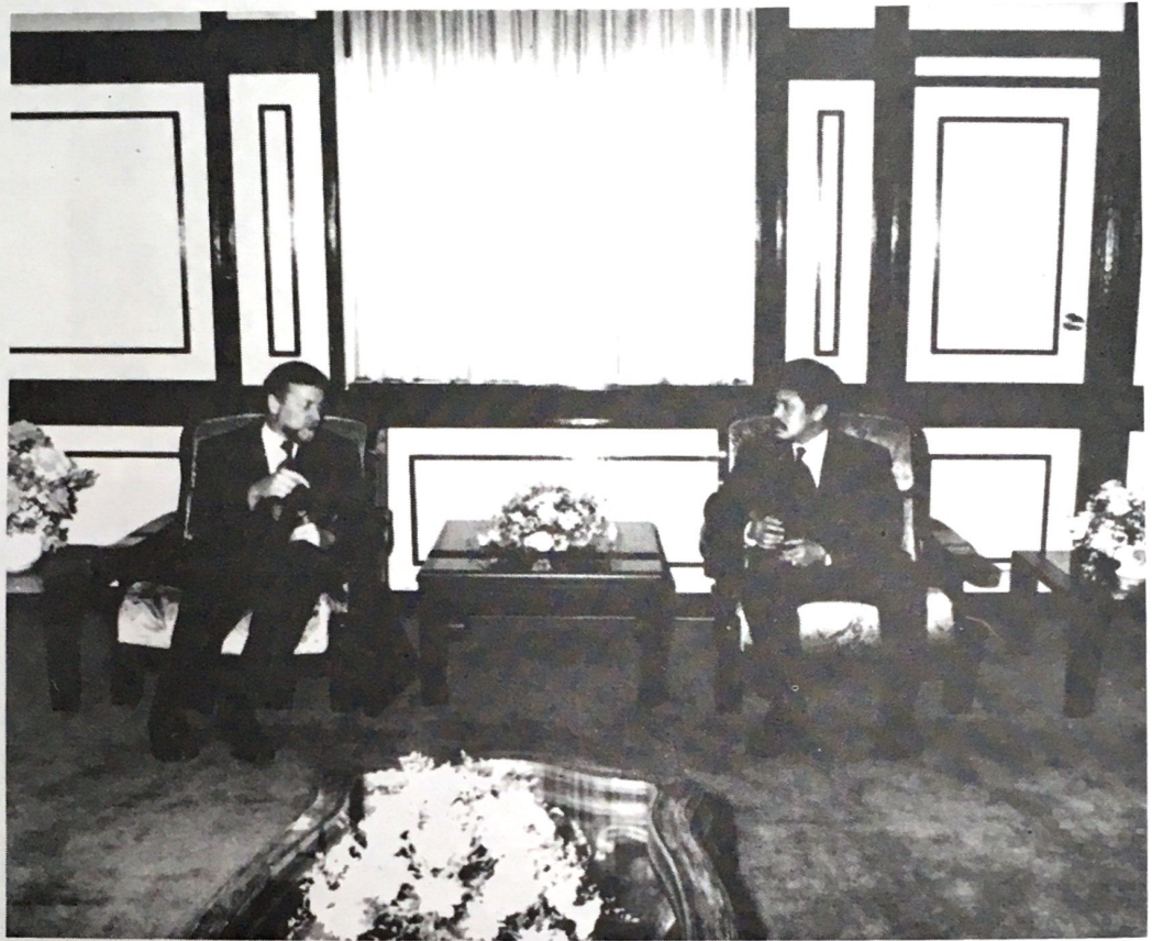
His Royal Highness Prince Mohamed Bolkiah, the Brunei Darussalam Foreign Affairs Minister and his visiting Australian counterpart, The Honourable Senator Gareth Evans QC seen deep in discussion when they met recently.

The Foreign Affairs Minister also expressed the satisfaction over Australia's commitment to being keenly involved in Asian affairs. He assured that Brunei Darussalam is just as determined to play its