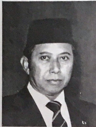
The Minister of Culture, Youths and Sports, Yang Berhormat Pehin Orang Kaya Digadong Seri Lela Dato Seri Paduka Haji Awang Hussain hoped that the newly-launched magazine 'Majalah Juara' would become classroom material as additional source of teaching and learning.

Yang Berhormat Pehin Orang Kaya Digadong Seri Lela Dato Seri Paduka Haji Awang Hussain, the Minister of Culture, Youth and Sports made the remarks when he officially launched a magazine published by the Dewan Bahasa dan Pustaka (DBP) or the Language and Literature Bureau called 'Majalah