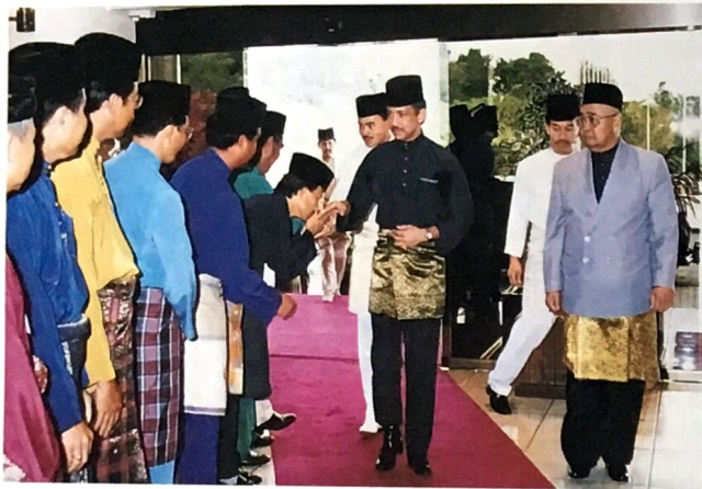
• From page 1 (Al-Qur'an)

The Holy Qur'an is a reminder and a blessing, and any Muslim who is close to the Al-Qur'an is one who is exposed and close to the blessings of Allah, God the