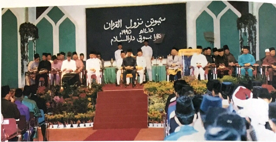
Above: His Majesty on the dais with Their Royal Highnesses Prince Haji Al-Muhtadee Billah, Prince Mohamed Bolkiah and Prince Haji Sufri Bolkiah and other members of the royal family as well as state dignitaries at the Revelation of the Koran anniversary celebration. Hosts of officials led by the Minister of Religious Affairs (to HM's left) greeted the royals' arrival at the International Convention Centre, picture at left. In his speech, right, the monarch urged Muslims to get even closer to the Koran and its teachings.