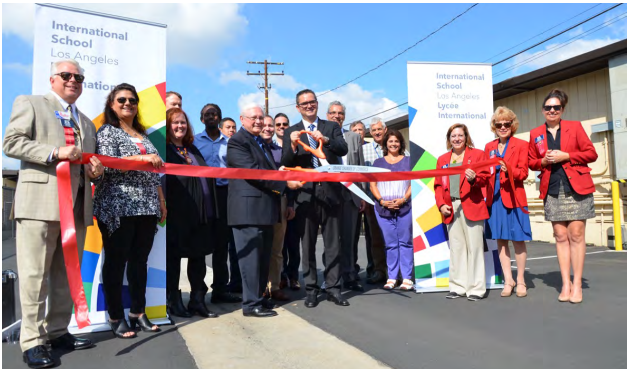
Orange County Campus Ribbon Cutting