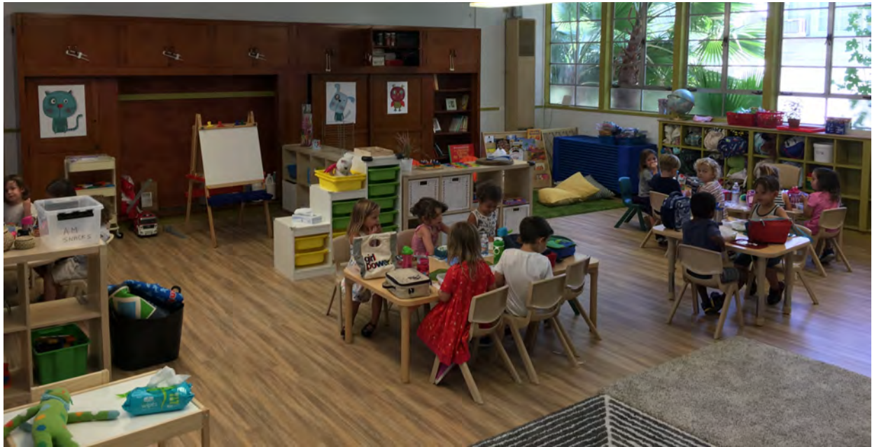
Los Feliz Early Learning Center