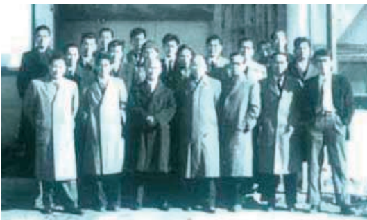
Researchers at the time gathered in front of the entrance of Japan Monkey Centre, completed in 1967.

to the conditional equality of human society. The origin of human family and sociality is still a major focus in primatology and anthropology. The conservation of endangered species, including great apes, and the preservation of indigenous cultures have also become important tasks. With the rapid advancement of globalization, field studies on human and non-human primates are having an increased impact on policy making and bringing harmony to human communities.