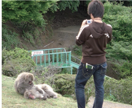
Student field work at Arashiyama Monkey Park