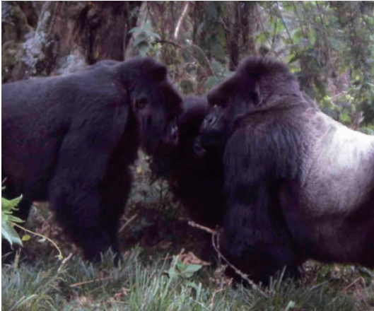
Face-to-face communication of gorillas