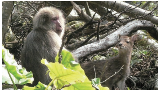
Japanese macaque and deer