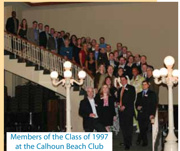
Members of the Class of 1997 at the Calhoun Beach Club