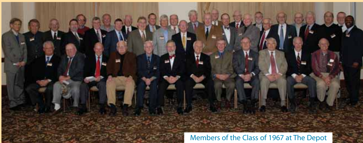
Members of the Class of 1967 at The Depot