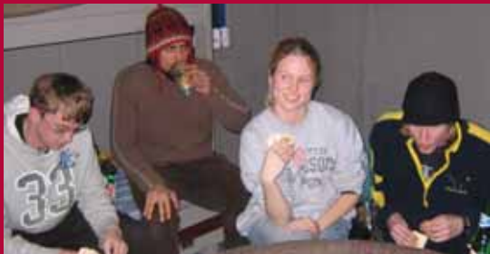
◀ LLM students spend a winter weekend on one of Minnesota's many lakes ice fishing and playing cards.