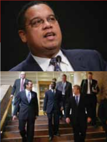
Both U.S. Congressman Keith Ellison ('90) (top) and Governor Tim Pawlenty ('86) (bottom, at left) spoke at the Law School this spring about their experiences as law students and politicians.

“but when people talk about justice, it is not something to be muttered.”