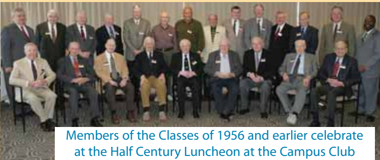
Members of the Classes of 1956 and earlier celebrate at the Half Century Luncheon at the Campus Club