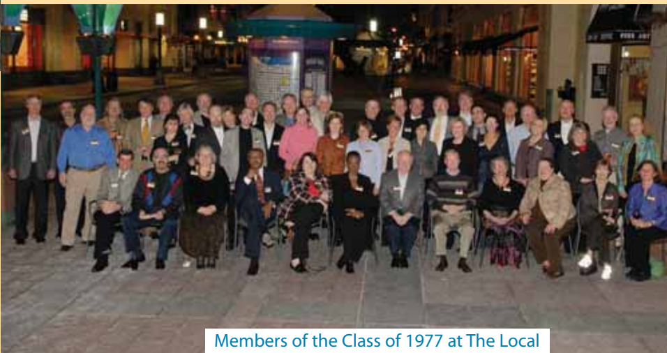
Members of the Class of 1977 at The Local