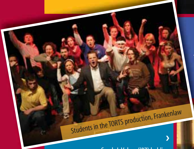
Students in the TORTS production, Frankenlaw