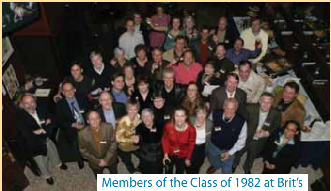
Members of the Class of 1982 at Brit's