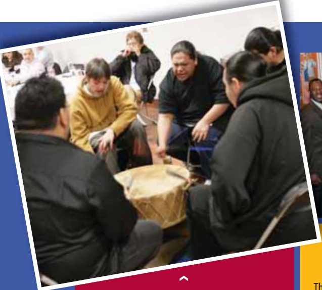
^ A traditional drumming group at the National Native American Law Moot Court Dinner on February 16.