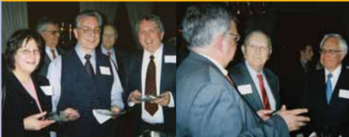
Alumni enjoying The Kitchi Gammi Club