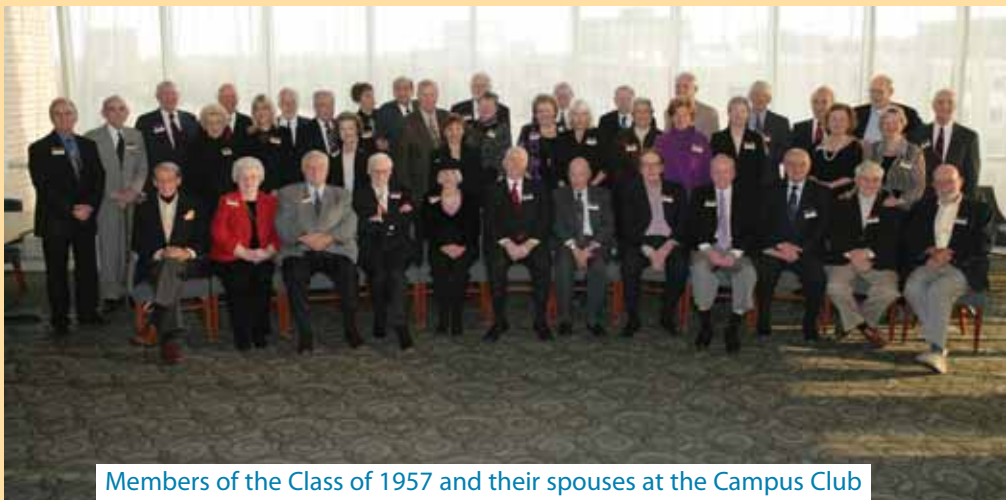
Members of the Class of 1957 and their spouses at the Campus Club