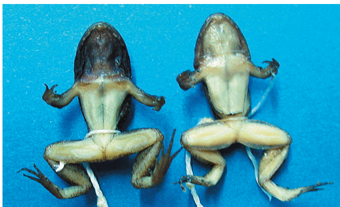
Fig. 2. Ventral view of Leptodactylodon stevarti nov. sp.; left IRSNB 1928 holotype; right SMNS 11774 paratype.

Rückenansicht von L. stevarti nov. sp.; links IRSNB 1928 Holotypus; rechts SMNS 11774 Paratypus.