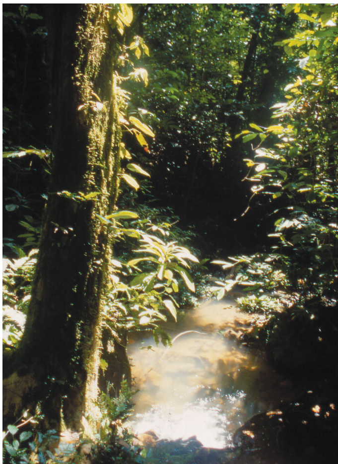
Fig. 4. Small forest stream. Locality of the paratype (SMNS 11774).

Kleiner Waldbach, Lokalität des Paratypus (SMNS 11774).