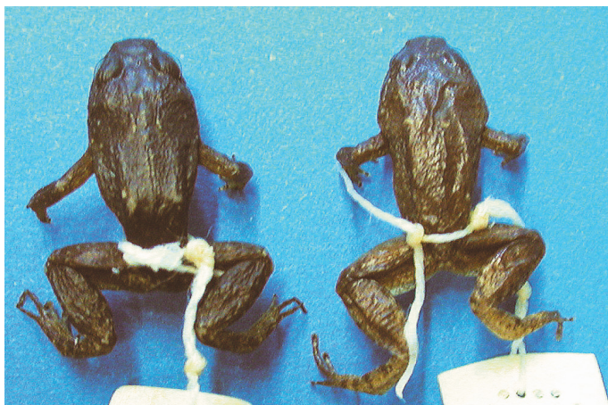
Fig. 1. Dorsal view of Leptodactylodon stevarti nov. sp.; left IRSNB 1928 holotype; right SMNS 11774 paratype.

Rückenansicht von L. stevarti nov. sp.; links IRSNB 1928 Holotypus; rechts SMNS 11774 Paratypus.