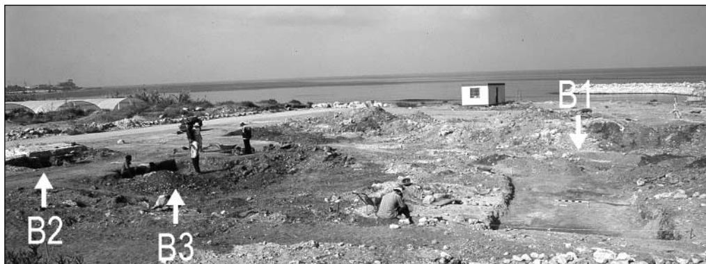
Fig. 2. Trial pits B1-B3 in the first days of excavations

Further in the same sector brought to light a nondescript rectangular structure made of sandstone blocks (B5), as well as another well and nearby basin (B6). These were cleaned and recorded, but their precise function could not be determined.