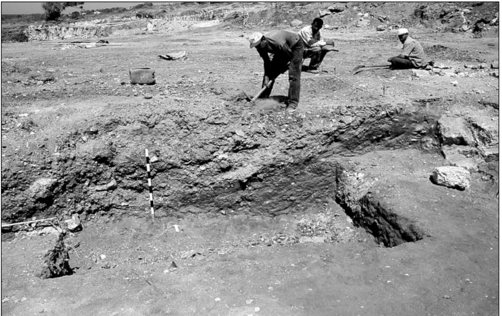
Fig. 4. Pottery dump in trial pit B1, visible north trench wall with a section through the dump

A sprinkling of imported fine ware fragments (see below), regularly distributed through all the trenches and layers, indicated that the pottery dumps had accumulated in the course of the 2nd century BC. A comparison of coarse ware forms from the dumps with parallels from other sites in the region (mainly Beirut) confirmed the dating.