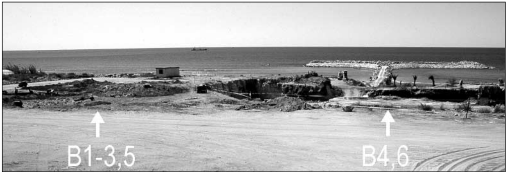
Fig. 1. General view of the southern part of the necropolis

The site was tested in 2004 (cf. Fig. 1 on p. 424 for a plan of the site with the location of trenches and areas surveyed geophysically). Trial pits B1-B3 were dug in the southern part of the necropolis [ Figs. 1-2 ], where