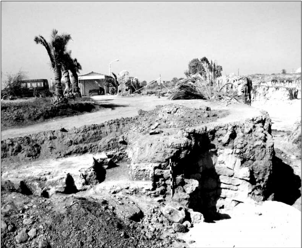
Fig. 10. Well 2 and basin (B6) seen from the south-east

Once the basin was filled, some other structure was erected on the same spot. Remnants of a gravel-and-lime floor are suggestive of a chamber measuring 4.28 by 2 m. Of great interest is the layer beneath the room surface, about 0.10-0.15 m thick and consisting of pure white sea sand. The sea level must have been higher at one point, allowing sand to accumulate over the last ancient occupation layer dated to the Hellenistic period. Therefore, Well 2 could also date from that time, as it had been filled with the same type of sand.