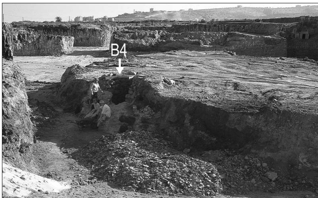
Fig. 3. Well 1 (B4) with a mound of non-diagnostic sherds from the excavated fill seen in the foreground