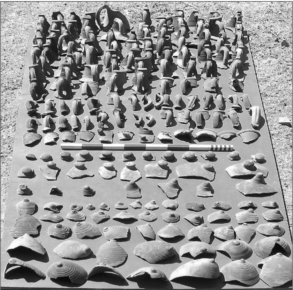
Fig. 9. Locally made transport amphorae fragments from Well 1 (B4)