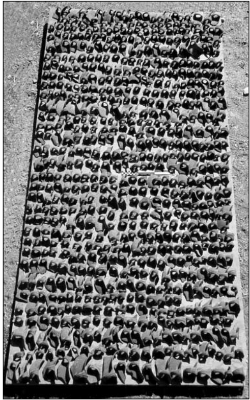
Fig. 5. Locally made cooking pot fragments from trial pits B1-B3 (Photo K. Domžalski)

Two types of cooking pots prevailed in the assemblage: a globular pot with collar-type vertical rim [Fig. 5] and one with an outward-slanting rim. Fragments of the first form were the most numerous. Pot stands, flat-based bowls and dishes, jugs and lids were of fairly similar shape, differing in size alone. Interestingly, almost all of the lids had handles intentionally pierced with a pointed tool.