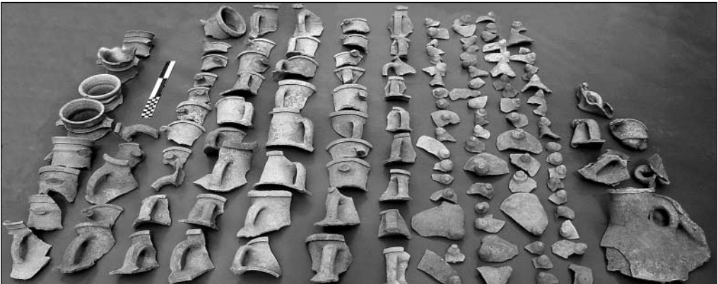
Fig. 6. Locally made transport amphorae fragments from trial pits B1-B3; note wasters on the right