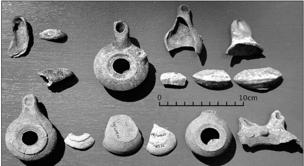
Fig. 7. Imported (above) and locally made (below) oil lamps from trial pits B1-B3; note the lamp with unpierced nozzle in the bottom left corner

The first group was represented by undecorated bowls with incurved rims, plates