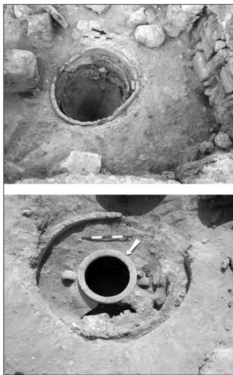
Fig. 8. Bread oven ( tannur ) in unit 44, view after completed exploration (top) and the same oven with a storage jar installed in a pit that destroyed the structure

by Roger Saidah's team and there were even traces of test trenches dug under the floors. Current excavation in unit 44, which stood on walls from an earlier settlement phase, cleared the remains of a bread oven ( tannur ) under the level of the missing floor [Fig. 8]. Its diameter reached 1.47 m and the preserved height was 0.48 m. The bottom portion made of