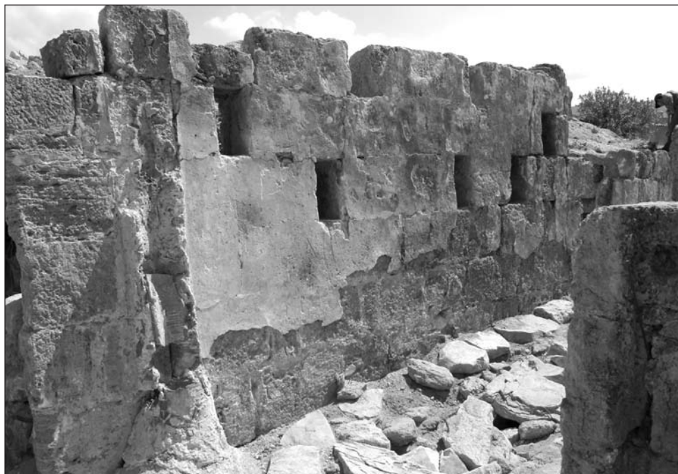
Fig. 6. Terracotta drain mortared to the wall and windows opening onto street 8E in the eastern sector of the quarter