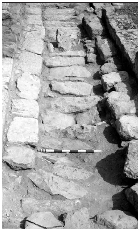
Fig. 4. Street 100, viewed to the east

blocks of local sandstone (locally referred to as ramleh ) were set up in loose rows on the street pavement and adjacent to the walls in the western section, to the north and south of the channel [Fig. 4]. These blocks may have served as walking stones during the rainy season. Two thresholds in the wall adjoining the street on the south are proof that the houses were entered from the passage. Another threshold lay in the western section of the street on the north side. Gaps in the walls in the central and eastern section of the street suggest further entrances. Rooms north of the street were not explored.