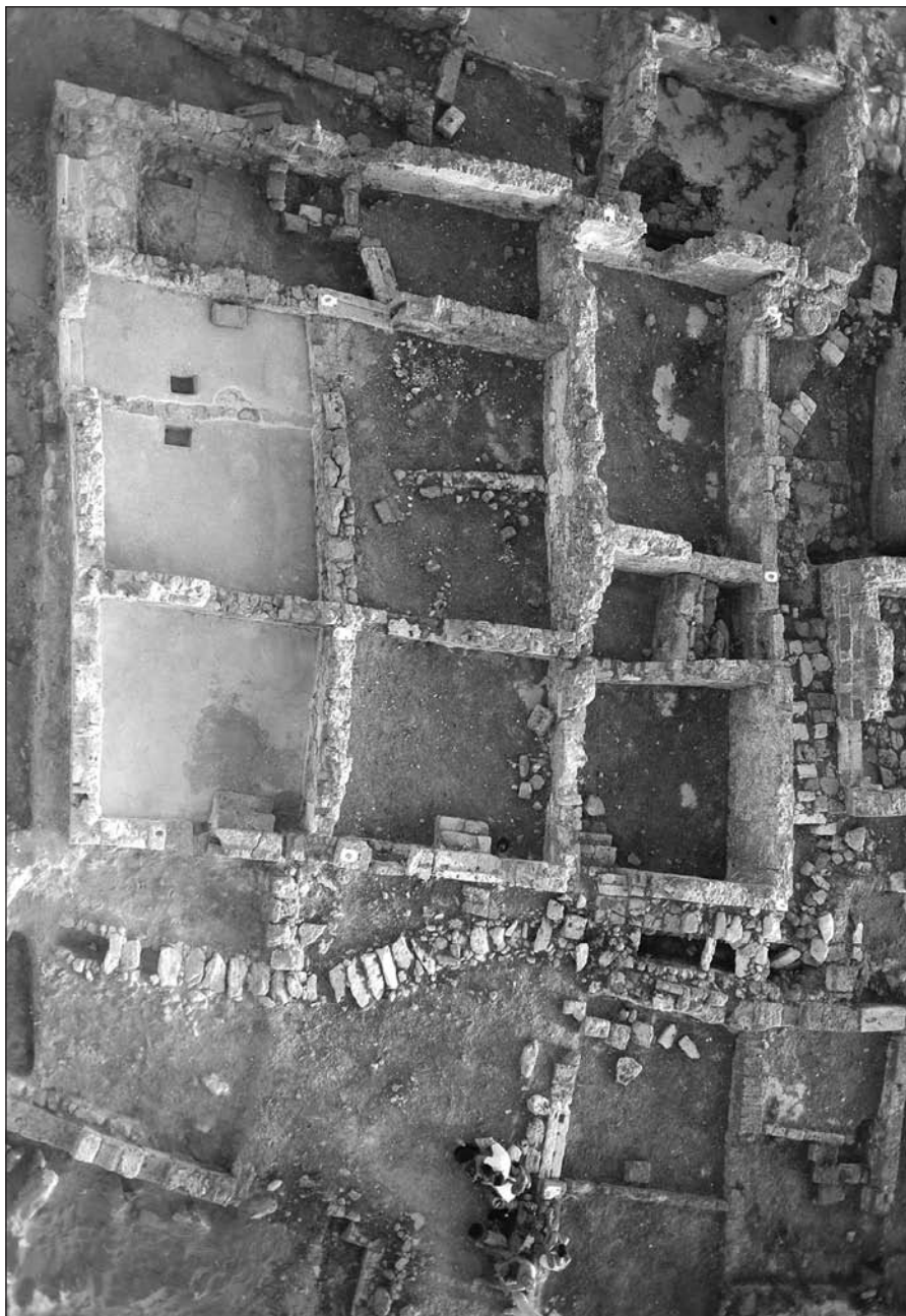
Fig. 9. Architectural complex 60, 69, 76, 101, 102 and 108 in the western sector of the quarter; north is at top