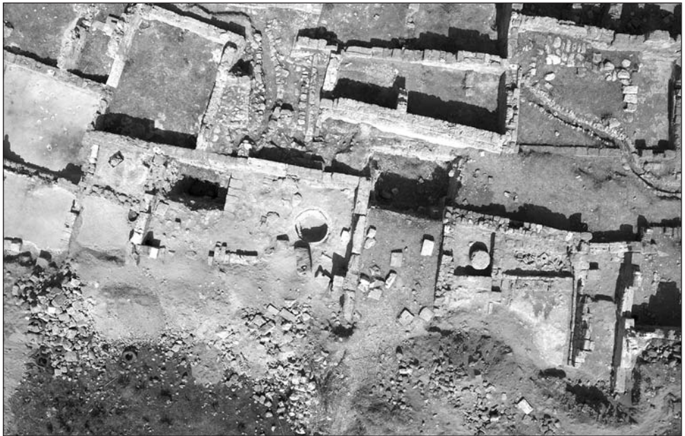
Fig. 7. Units 40, 41 and 44 in the southern sector of the quarter

A few units, which had been observed as the outline of walls under secondary deposits, were cleared in the southern sector. They were not distinguished in any way, being furnished with simple lime mortar floors or white mosaic pavements and plastered walls, as in other parts of the dwelling quarter [Fig. 7]. A significant difference in floor levels, reaching 0.50 m, was recorded between adjacent units. The units had evidently been cleared in 1975