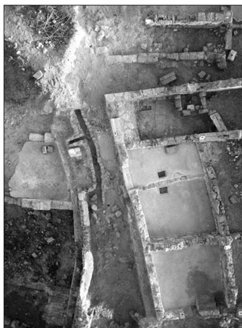
Fig. 11. Street to the west of unit 101