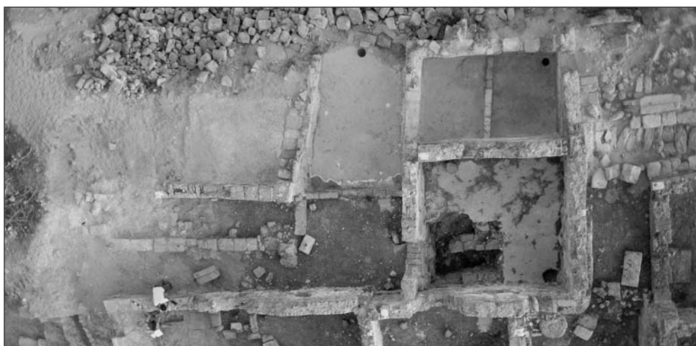
Fig. 3. Units 107, 109, 110 in the northern sector of the quarter