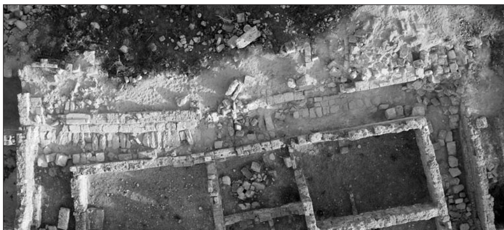
Fig. 2. Street 100 in the northern sector of the quarter

blocks. It was part of a sewage system for discharging rainwater, in this case beginning next to the entrance to unit 48. Having reached its highest point in this place the channel subsequently bifurcated to the south and north, toward the said street, while dropping continuously. Single