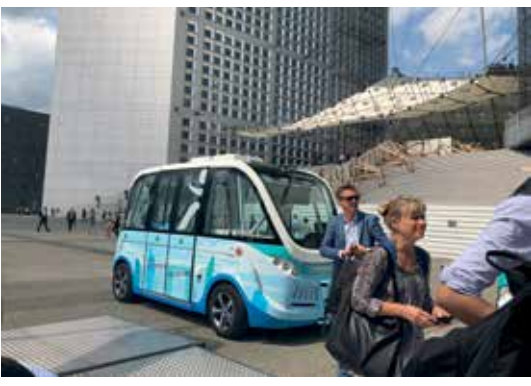
POLIS Working Group testing fully automated shuttles operating in La Defense, Paris.

While the primary purpose of the Working Group is to provide a meeting space for peer-to-peer discussion among POLIS members, it also delivers tangible outputs, such as the POLIS papers on automated vehicles and on Mobility as a Service (MaaS). The papers bring a much-needed public sector voice to the narrative surrounding automation and MaaS, and highlight the instrumental role of cities and regions for a policy-responsive deployment of such technologies and approaches.