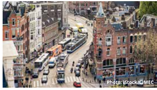
Amsterdam joined the debate on C-ITS in cities within the CIMEC City Pool.

The CIMEC roadmap describes what Cooperative Intelligent Transport Systems (C-ITS) are and how they may benefit cities and regions. It highlights issues that local authorities and the wider industry need to consider for deployment to happen.