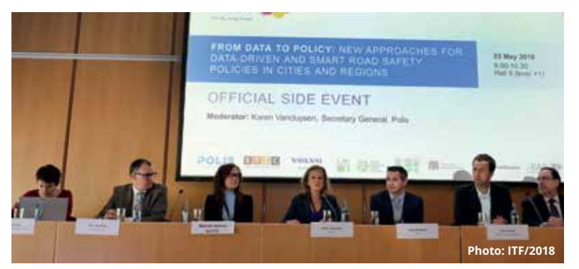
POLIS organised a side event in cooperation with New York City among others at the International Transport Forum Summit 2018 in Leipzig

Non-European cities can also become engaged in POLIS as associated members. International activities include cooperation with the OECD's International Transport Forum, the World Health Organisation, UNECE, the UNFCCC, SloCaT and SUM4ALL. POLIS also engages in exchange activities with US cities and regions, on the impact of transport innovations on local mobility.