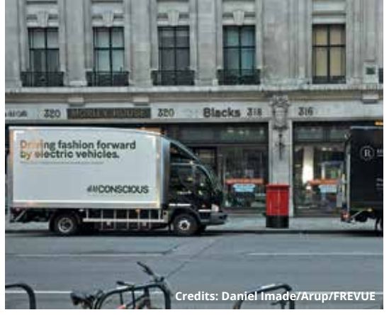
London aims at zero emission mobility and deliveries by 2025 in the city centre.

This pillar looks at understanding and addressing the impact that urban and regional transport has on the environment and on health. This includes air and noise pollution from transport, cleaner vehicles, electromobility and alternative fuels, climate change, walking and cycling, shared mobility services, and mobility management.