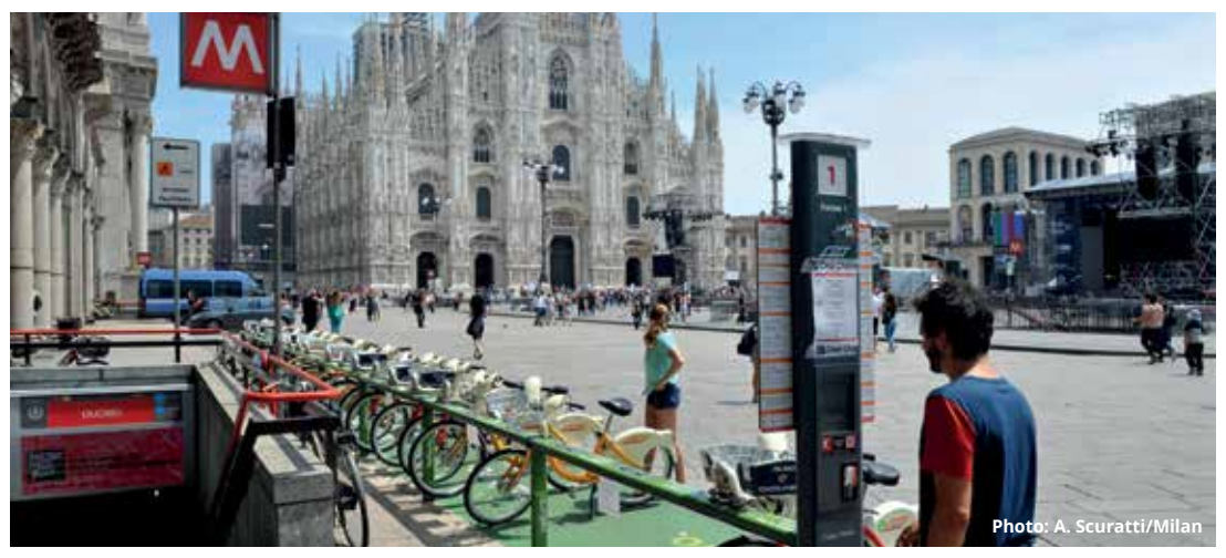
Milan introduced the Area C, a congestion charge scheme that makes room for active travel and new mobility services.

POLIS members jointly work on how to best address challenges such as parking, pricing, access regulations, infrastructure, and accessibility for all. The development of inclusive transport services, being public or private, is key in this regard. The pillar looks at both economic and social access, including access to transport services for people with reduced mobility, access to jobs, education and other services.