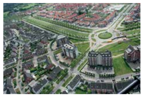
Helmond, "City of Smart Mobility", is a smaller city committed to innovation in transport.