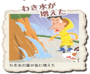
The amount of spring water suddenly increases.