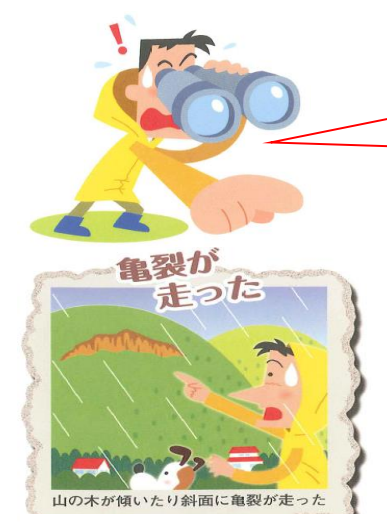
Tress on a mountain side start slanting and cracks on