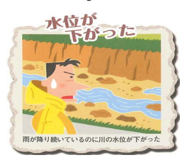
River levels dropping despite continued rainfall.