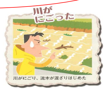
A river becomes murky and starting having driftwood.