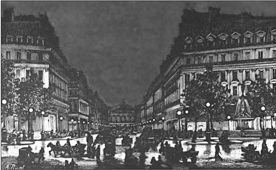
FIGURE 3 – Electric lighting with Yablochkov's candles along the Avenue de l'Opéra at the 1878 Paris Exposition. It triggered a boom in gas utility stocks.

models), the Yablochkov candle [10]. Its design featured two parallel electrodes set side by side to maintain their distance while consuming, with no need for automatic adjustment (Figure 2). To improve its performance, Gramme developed an efficient alternator in 1878 whose alternating current ensured the balanced consumption of the two carbon electrodes. The same year, the Grands Magasins du Louvre in Paris was supplied with eight Yablochkov candles powered by a Gramme alternator. Similar systems were soon implemented in the Avenue de l'Opéra and the Place de l'Opéra on the occasion of the Paris Exposition of 1878 (Figure 3).