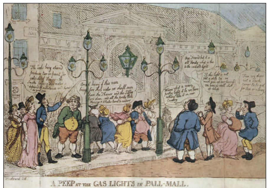
FIGURE 1 – A satirical cartoon showing people marveling at the early public gas lighting in London.

In a few decades, commercial and public gas lighting boomed in many cities in Europe (e.g., France, Belgium, Germany, and Russia) and the Americas (starting in the United States) because of its lower cost compared to conventional oil lamps and candles. The savings was about 75%. Even if gas lamps could