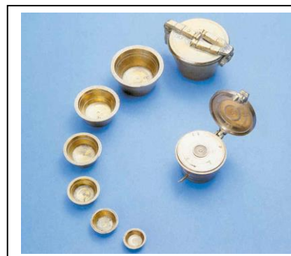
Nesting Weights Museum of the RPSGB

The only capacity measure in the Apothecary system was the liquid grain, the volume of one grain of water, which was introduced in 1885 as a "metric equivalent" but little used.