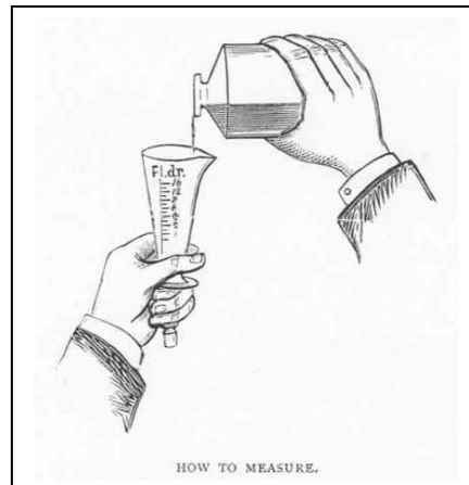
From Art of Dispensing , 1926