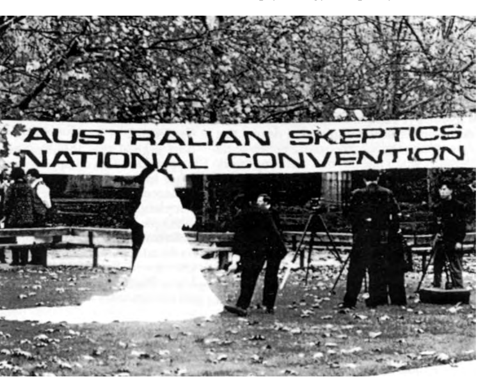
Seen at the Convention, an unnamed couple beginning their life together in an appropriate setting.