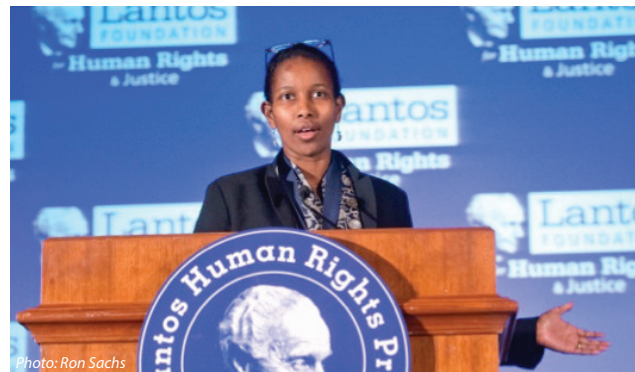
Ayaan Hirsi Ali receives the 2015 Lantos Human Rights Prize.