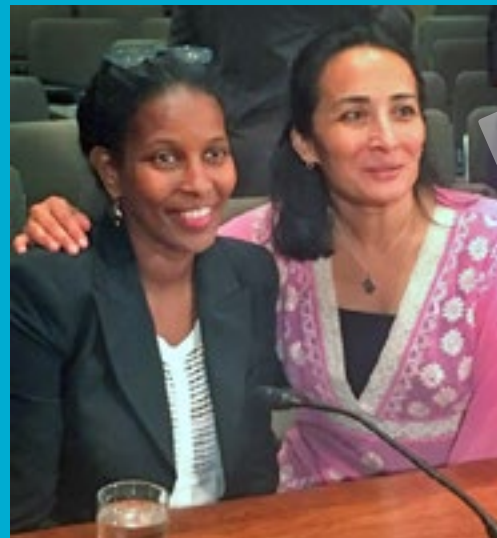
Ayaan Hirsi Ali and activist Asra Nomani at the U.S. Senate Committee on Homeland Security and Governmental Affairs

Through the campus program, as well as upcoming events, the AHA Foundation is excited to put our Founder's work into action by addressing Islamism.