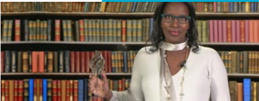
Ayaan Hirsi Ali accepts the Oxi Day Courage Award, October 26, 2017.

OUR FOUNDER was awarded the Oxi Day Courage Award from the Washington Oxi Day Foundation. This award honors leaders who have taken courageous action to preserve freedom and democracy. The award ceremony took place on October 26, 2017.