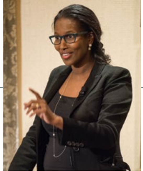
Ayaan Hirsi Ali, AHA Foundation Founder