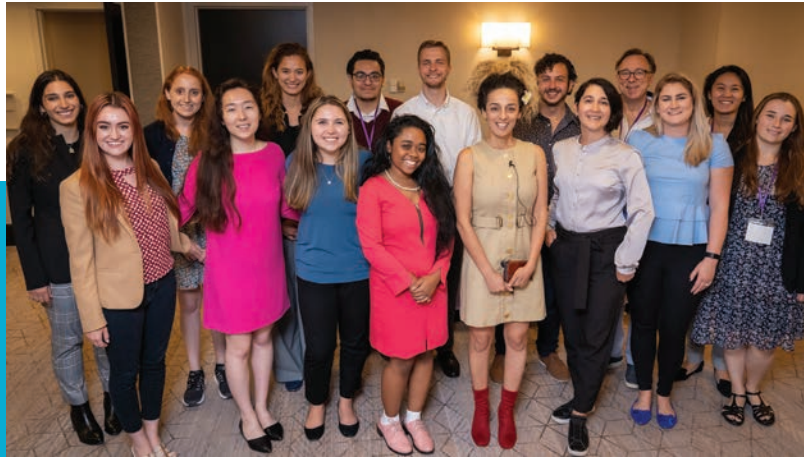
CTU fellows with AHA staff, and human rights activist, Masih Alenijad (front row, fourth from right) at the 2019 training.

Our college campus program, Critical Thinking Unit (CTU), defends freedom of speech by promoting and encouraging critical thinking in higher education and amplifying the voices of ex-Muslims and Muslim reformers. Student fellows also use the fellowship to advocate for the rights of women and protections against FGM, honor violence, and child and forced marriage.