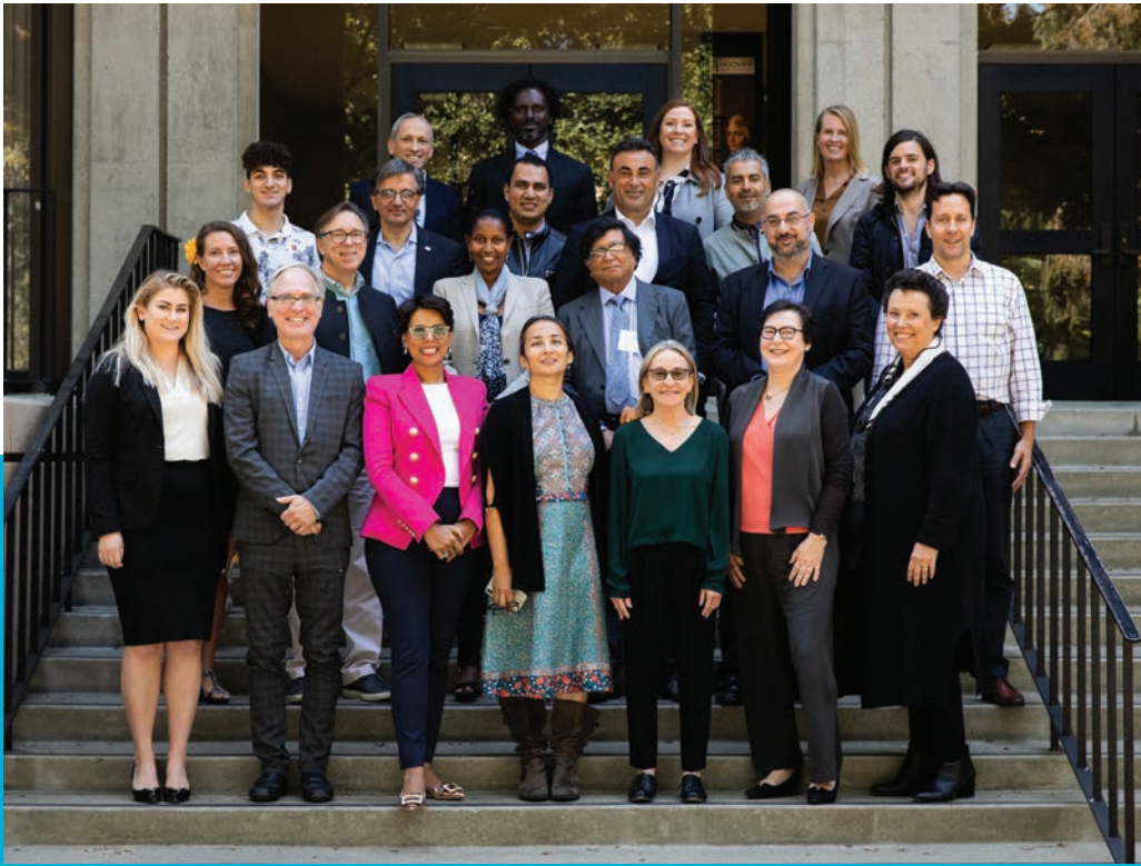
Seminar attendees from our Coalescing Networks to Combat Islamist Ideologies Seminar in Palo Alto, California.

After her bestselling book Heretic came out in 2015, Ayaan imagined making her vision a reality, one where voices of activists, Muslim reformers, and ex-Muslims are connected and amplified in the fight against Islamism, a dangerous ideology that threatens the Western civilization.