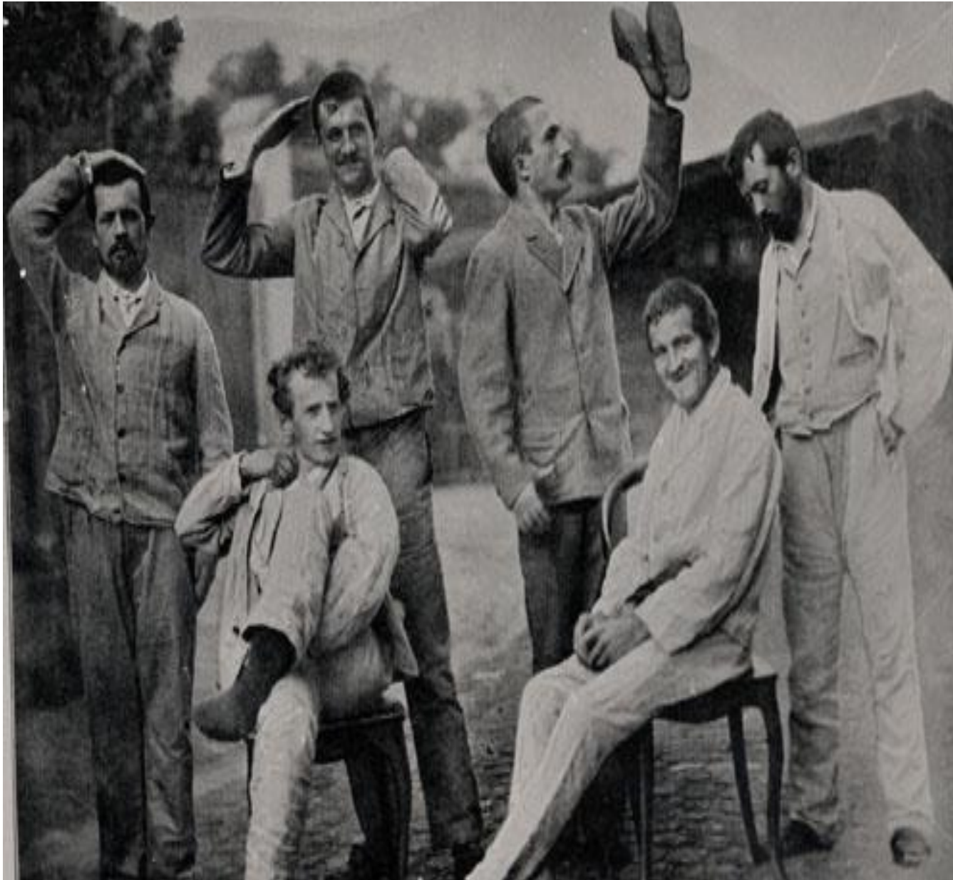
Photo of patients with catatonia from Emil Kaepelin's Psychia trie (1896)